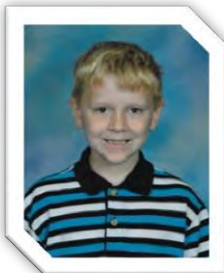
2 nd Grade

2016 Diagnosed With Autoimmune Eosinophilic Esophagitis