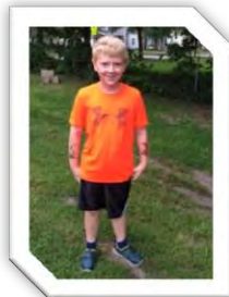
3 rd Grade

2017 Diagnosed With Obsessive Compulsive Disorder And High Function Autism