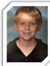
4 th Grade

2018 Diagnosed With Separation Anxiety And Depression