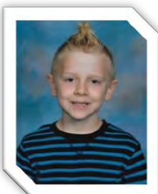
1 st Grade

2015 Diagnosed With Autoimmune Type 1 Diabetes