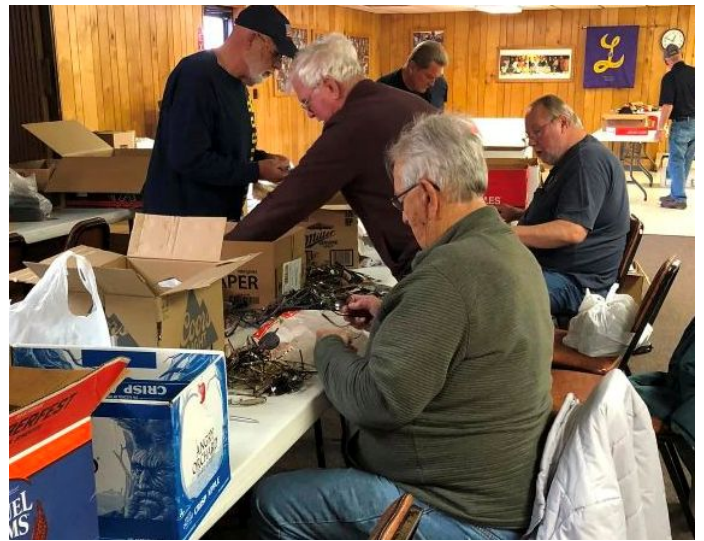
Pennfield Lions sorting