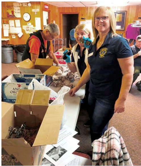
Marshall Lions sorting