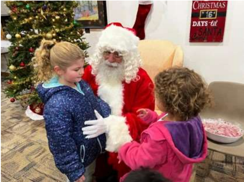
Santa listens to the Christmas wishes of two of the many children attending.