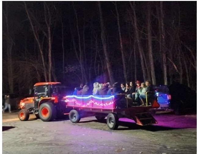
Coloring Christmas drawings is always a popular activity. Many guests took the hayride through the park to see the holiday lights.