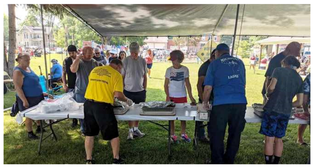
Lions serving up BBQ Chicken