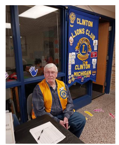
KidSight at Kindergarten Registration