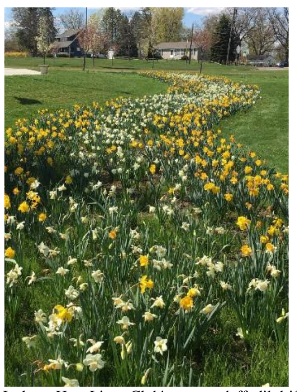
The Jackson Host Lions Club's newest daffodil drift in Sparks Park.