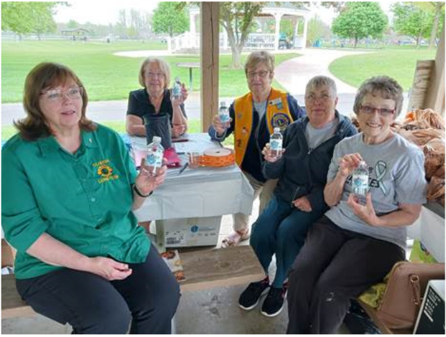
Lions Diabetes Awareness Walk received a donation of bottled water from Sielers Water Systems

Clinton Lions participated in the Diabetes Awareness Walk, KidSight at Kindergarten Registration, Summerfest, and held a Mother's Day Essay contest for 3<sup>rd</sup> graders.