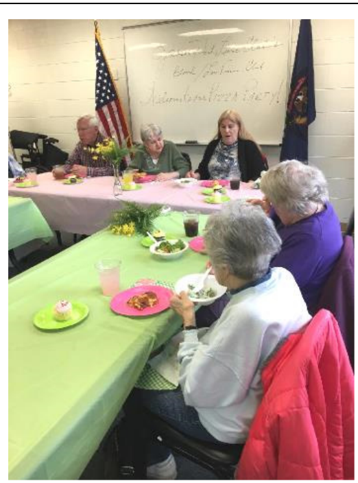
JHLC's Low Vision/Blind Club Annual April Pizza Party.