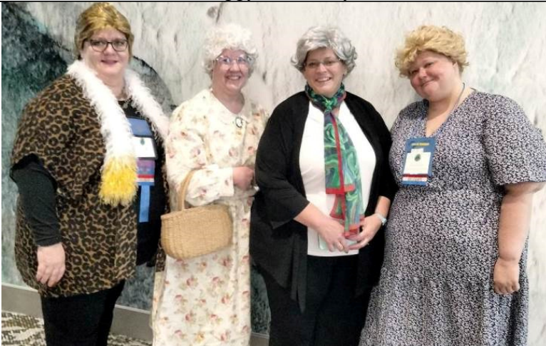
The Golden Girls