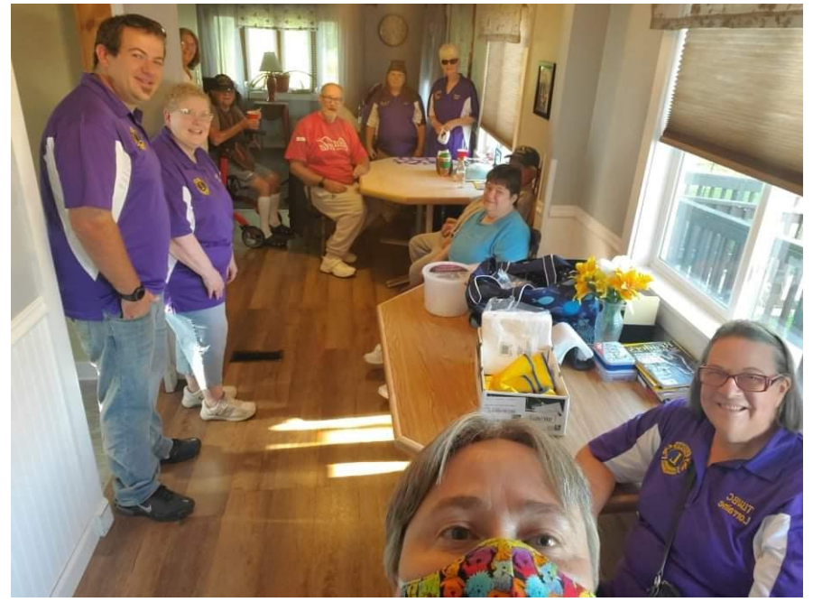
Promoting Lions at Calhoun County Fair in Marshall

Serving ice cream floats at Whispering Meadows Adult Care Home in Marshall