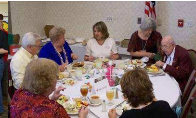
A table of diners - Dexter Lions