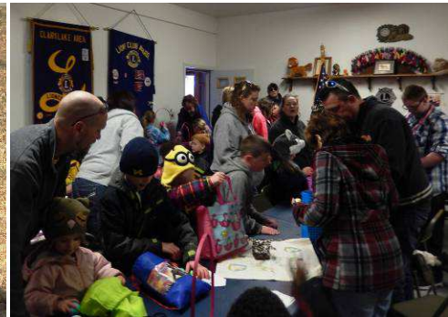
Counting Eggs . . . And the winner was?

Parents and Grandparents who brought kids were given cards that invited them to join the Clarklake Lions for a dinner meeting.