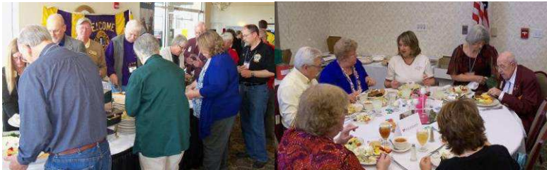
The luncheon line - fast 'n furious!