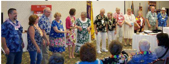
The Hawaiian dress contest got ‘em lined up with judges having a tough time making the call. The Lions and Leos were judged separately.