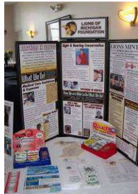
Lions of MI Foundation