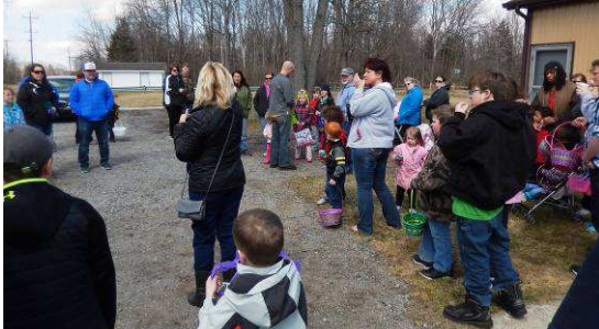
OK, here are the rules . . . No Parents in the hunt!

ON April 4, 2015, the Clarklake Lions, along with the Clarklake Community Church, hosted the first annual Community Easter Egg Hunt. Over 50 children, ages 2 to 10 years old, collected all of the 450 Easter Eggs hidden in and around the Clarklake Lions Clubhouse. (Except one egg - grabbed by a Crow while we waited for the kids to arrive.)