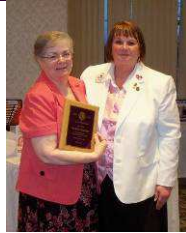
Lion of the Year!