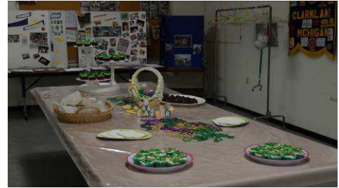
Snacks while we wait . . . And after the hunt.