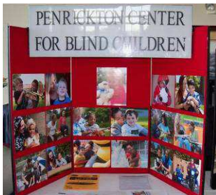
The Penrickton Center

Saturday morning , I arrived early, so I had a little time to peruse the many vendor displays before the 9AM Memorial Service. Here are some prime examples of the displays at convention: