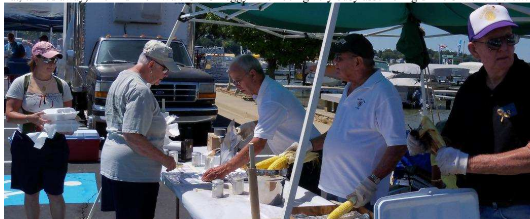
The corn crew, with one guy peeling, one dipping in butter and one wrapping and packing. Great teamwork!