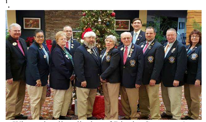
What a dazzling display of District Governors!

The Council of Governors met on December 4th – 6th in Lansing.