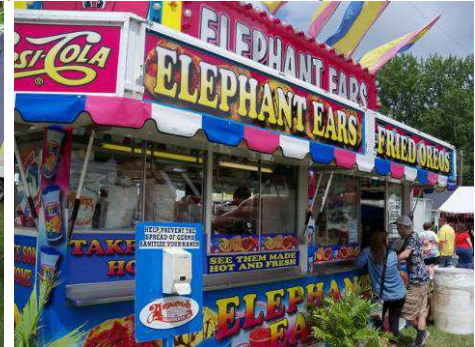
Miss Shoreline Quinn Fischman Draws a ticket to see what lucky person might win this boat! And what carnival would be complete w/o Ears?