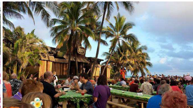
Michigan Night at the Luau