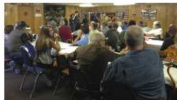
Lunch, door prizes, social time