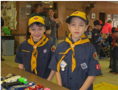
Two members of the Napoleon Cub Scouts get ready to race.