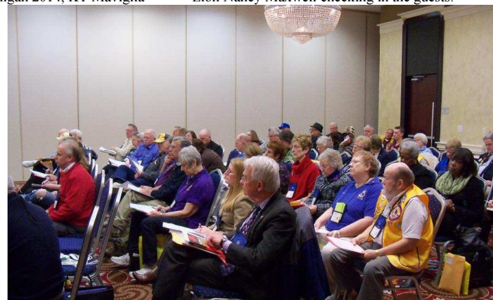
A large group of attentive Lions at the “Marketing Your Club” breakout session