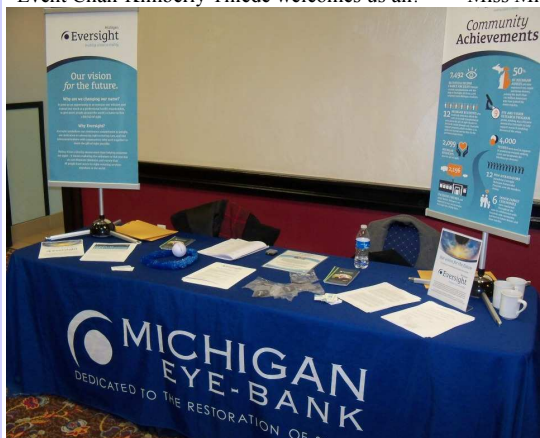
The Michigan Eye Bank becomes “Eversight” this year.