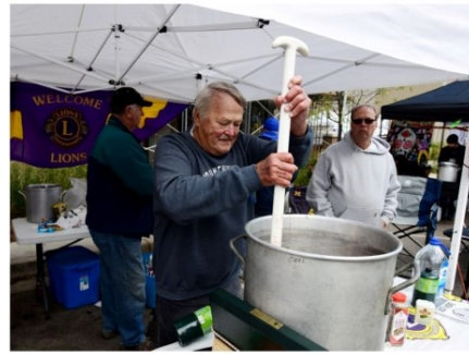
Caption: Vandercook Lake Lions Club members stir chili the K105.3 Fall Fest and Chili Classic along Michigan Avenue in downtown Jackson on Saturday, Oct. 16, 202. The event featured vendors, a chili cook-off, live music and kids activities.