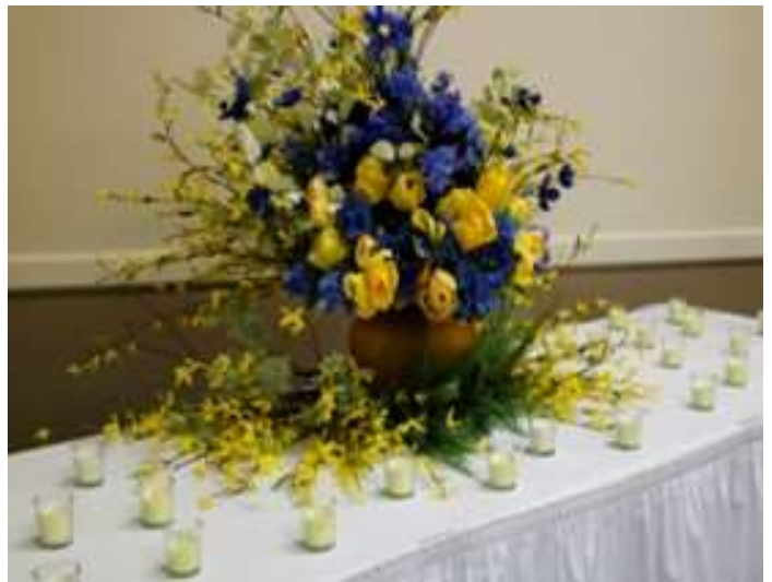
The Memorial Service honored our 11-B1 Lions that died this past year. Our memories of them will live on.