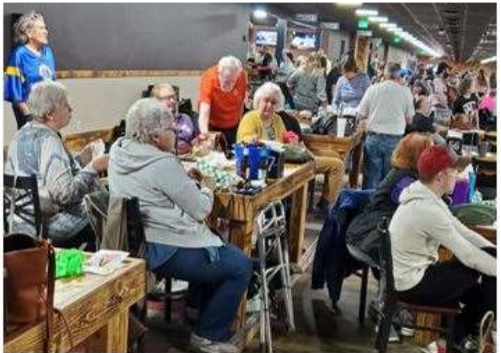
The club's bowling fundraiser at JAX 60 in Jackson was a huge success.