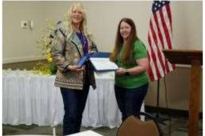
Charles Weir Sight Conservation Fellowship to ZC Gest.