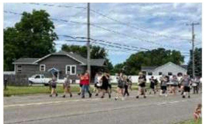
Michigan Center High School Band marches in parade.