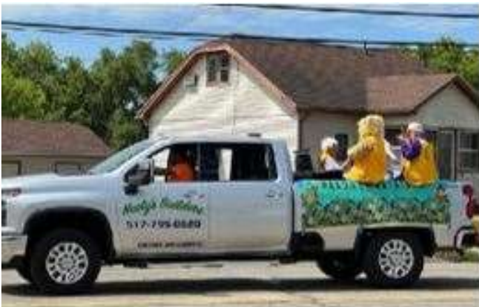
Michigan Center Lioness ride in Carp Carnival Parade.