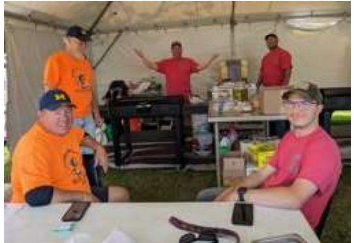
Michigan Center Lions sell their Smash Burgers.