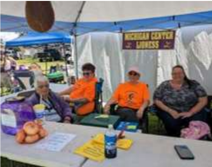
Lioness had onions, meat raffle tickets and koozies.