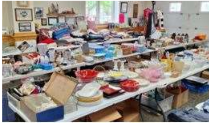
The clubhouse sold items donated by the public.