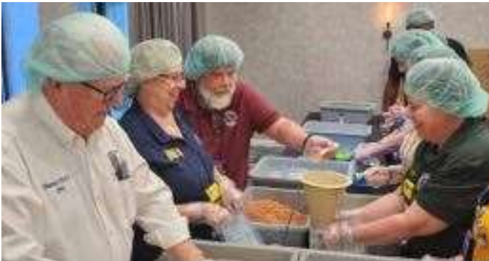
Cereal City Lions with the Food Packing Service Project.