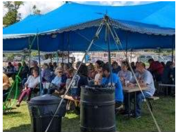
The Carp Carnival crowd enjoyed the live music.