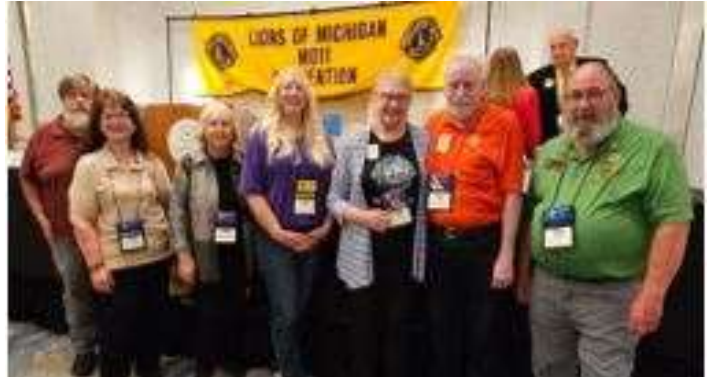
The MD11 Convention. Not Pictured Dorothy Bosse.