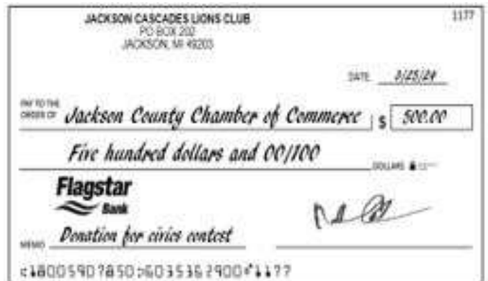
Our club donated $500 to the Jackson Chamber of Commerce to sponsor a high school civics contest.