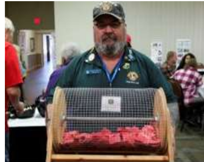
Lion Ivy with basket of tickets. Were you a winner?