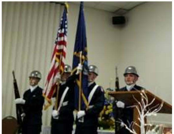
The convention Honor Guard posted the colors, followed by the Invocation and Pledge of Allegiance.