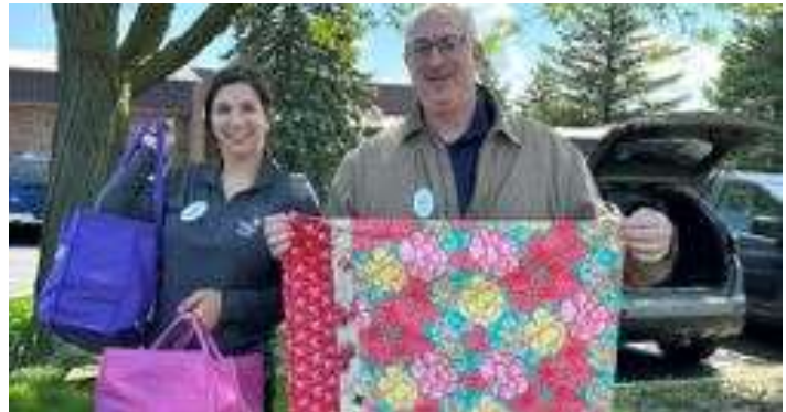
Quilts and pillow cases were donated to Camp Quality.