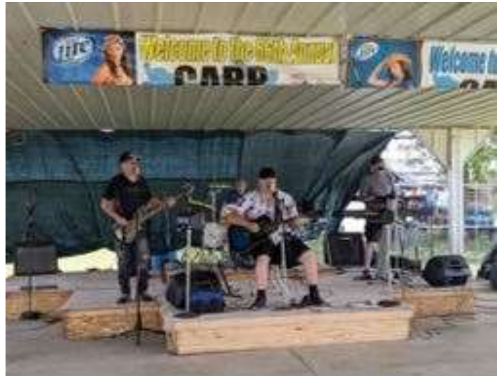
The Southern Roads Band performed on Sunday.