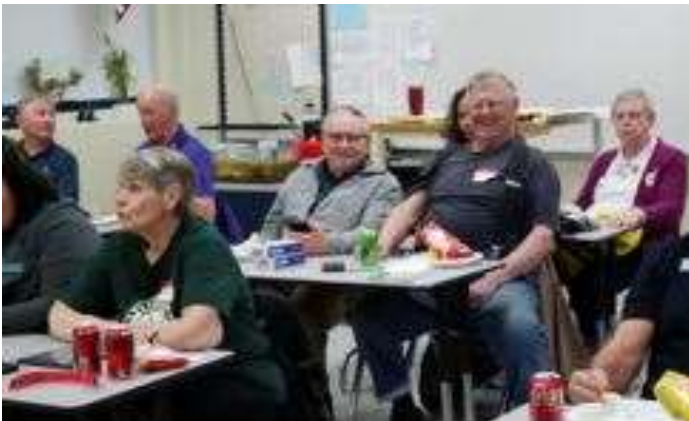
Lions enjoy training at Vandercook Lake High School.