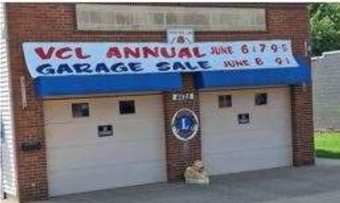
Vandercook Lake Lions Club Annual garage sale.