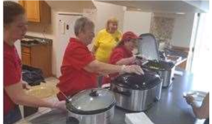
Members volunteer their time to prepare and serve fellow Lions and the community a good breakfast.