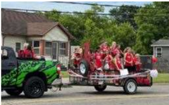
One of the Michigan Center ball teams in the parade.