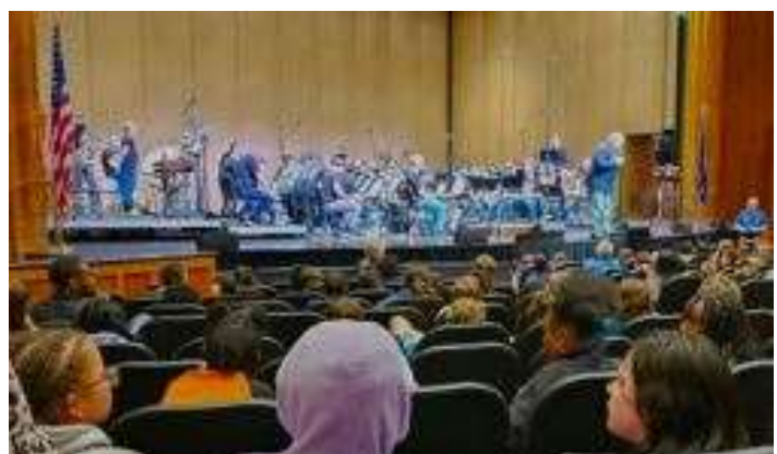
The Battle Creek Brass Band Concert for the Children.