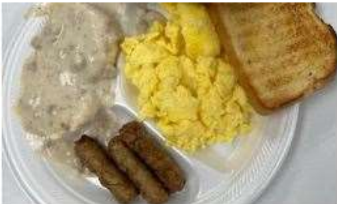
Lions breakfast has biscuits, gravy, sausage links, Scrambled eggs, toast, pancakes, coffee, and milk.