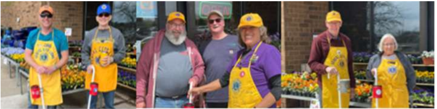
The White Cane Fundraiser was at Horrocks Farm Market, 5801 Buckley Rd., Battle Creek, Michigan on 28 April.