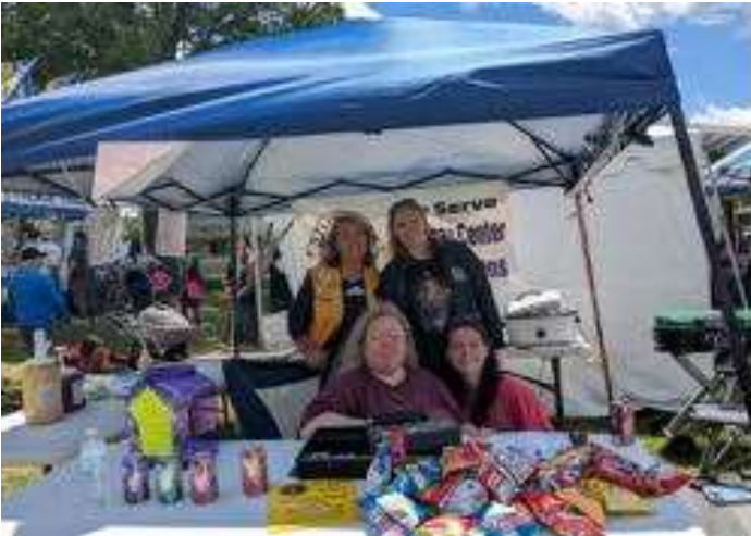
Michigan Center Lioness coney and hot dog sales.