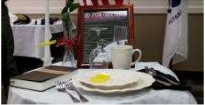
The Prisoner of War table was set up for presentation, as each item had a specific reason for being displayed.