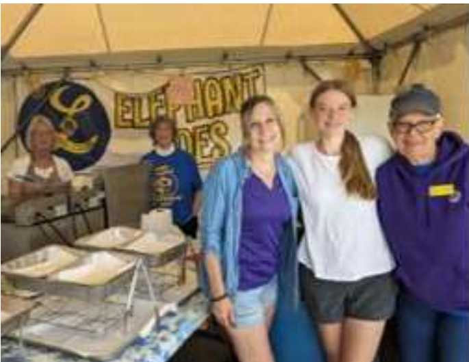
The Michigan Center Lioness sold elephant toes.