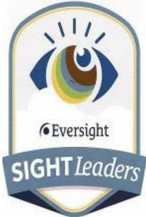
Club banner patch

You can be a driving force for restored sight by contributing $500 or more every year.