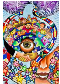
"Children Know Peace" 2011-12 Grand Prize Winner

November 15: Postmark deadline for a club to send one winning poster (per contest sponsored) to the district governor.