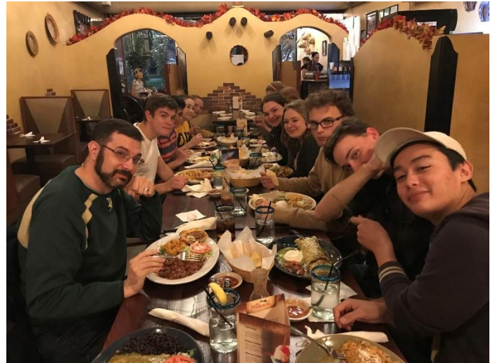
Thanksgiving Dinner Social