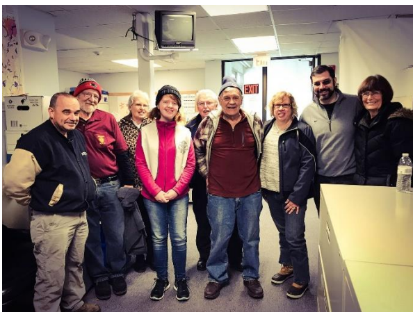
Dighton Community Food Bank