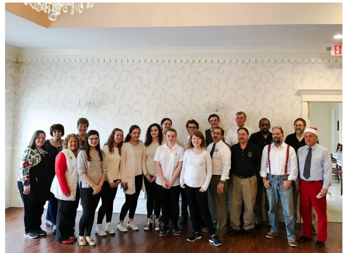
Senior Citizens Holiday Dinner