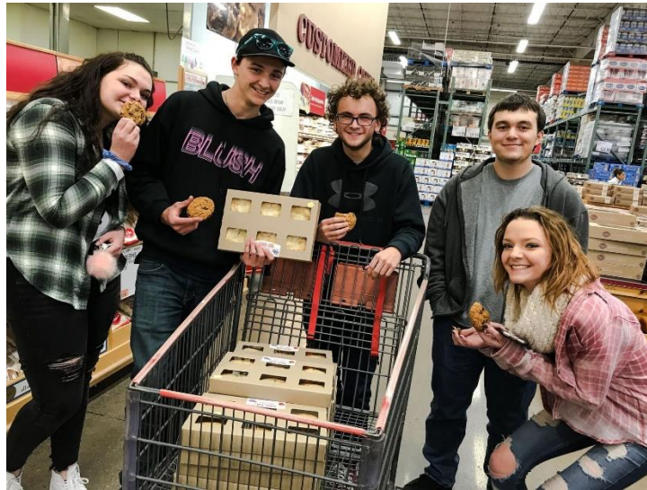
Food Shopping for the Leo's Soup Kitchen