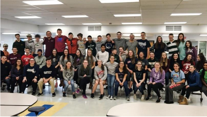
Canned food drive sort w/ DR Student Government