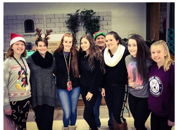
Dighton Toy Giveaway