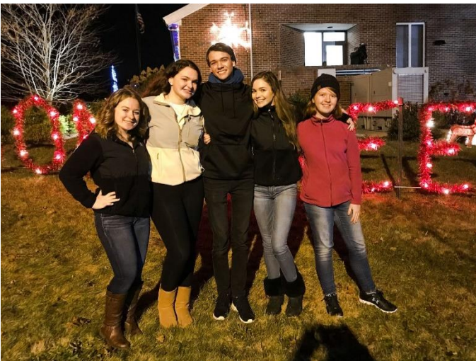
Dighton Lights On 2017