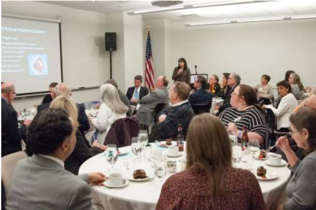
Lions dinner at Tufts 2019