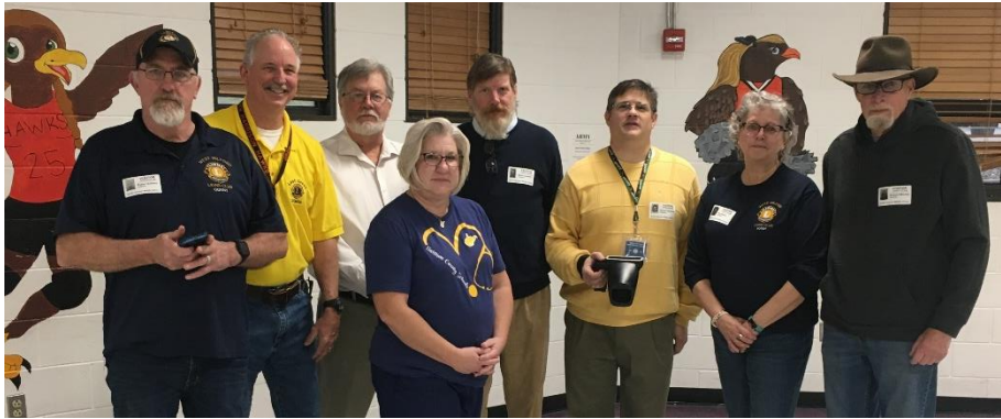
Lions from Lost Creek and West Milford clubs collaborated to do 88 eye screenings at Lost Creek Elementary and South Harrison Middle Schools on the 6 th of December 2022.