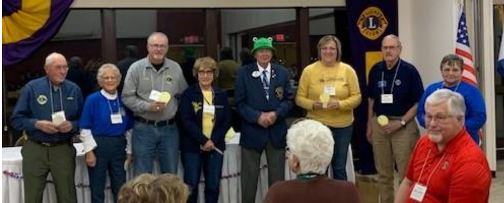
Group photo of hardworking Lions at the Conference