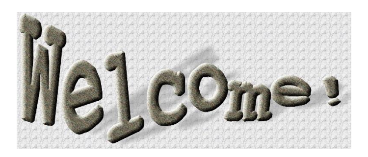
New Members for June & July 2023