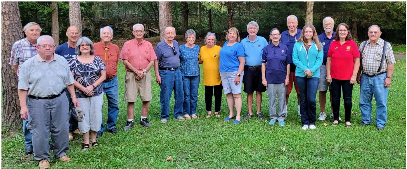
The members of the Wardensville Lions club at the picnic.