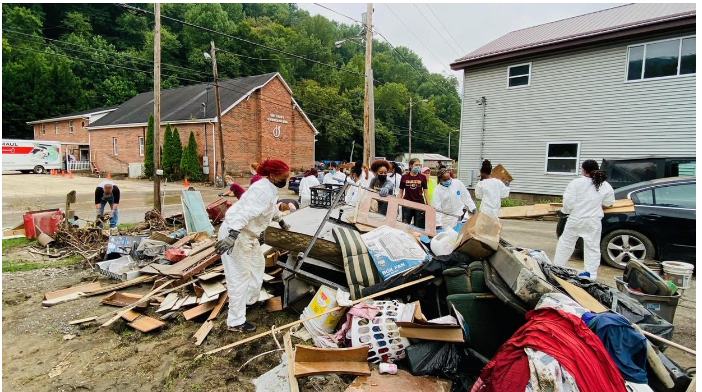
Lions teaming up with the University of Charleston's Women's Basketball team in Smithers, WV