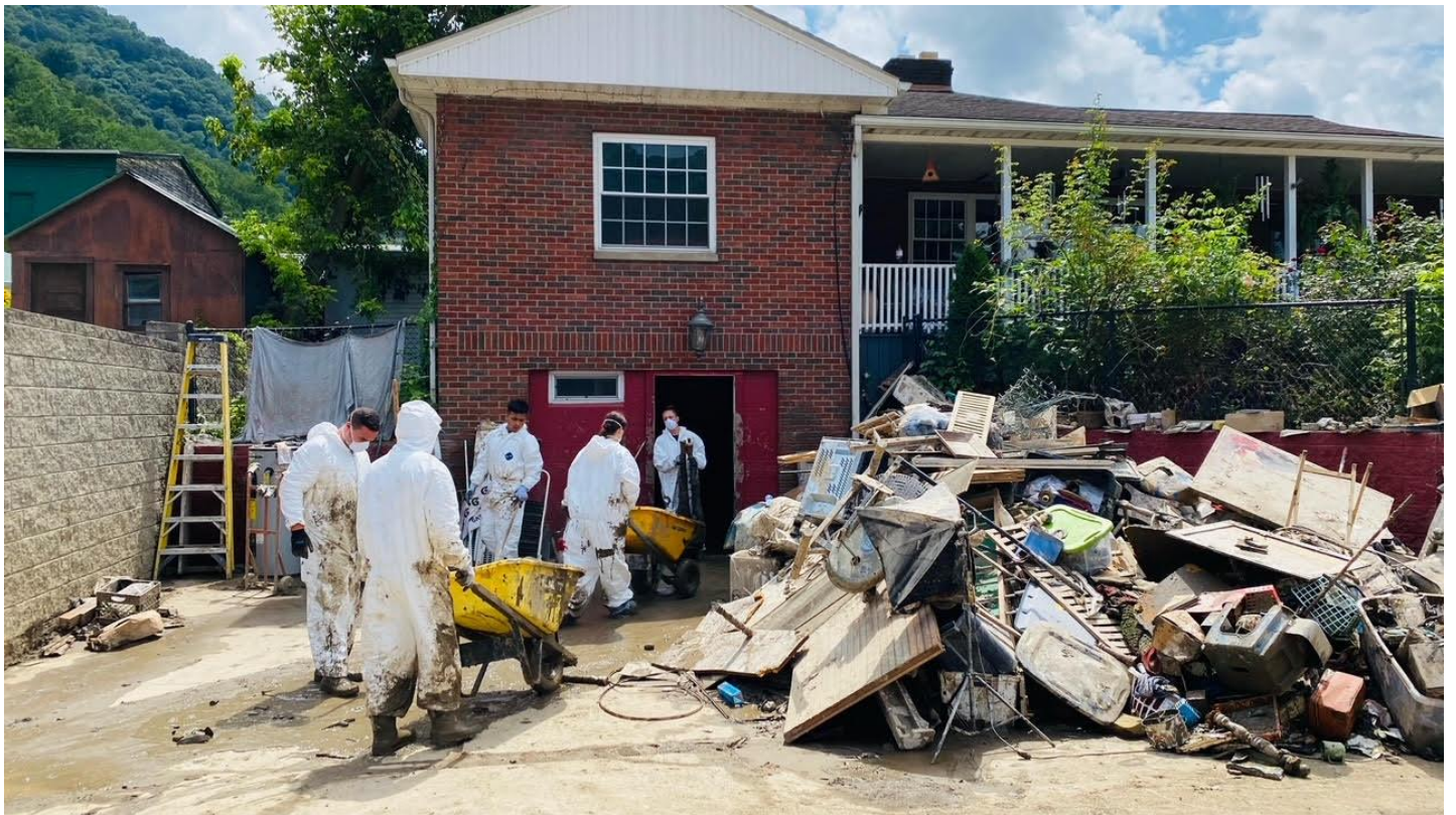
Lions teaming up with medical school students from the West Virginia osteopathic school of medicine to pull flood debris out of homes in Smithers, WV.