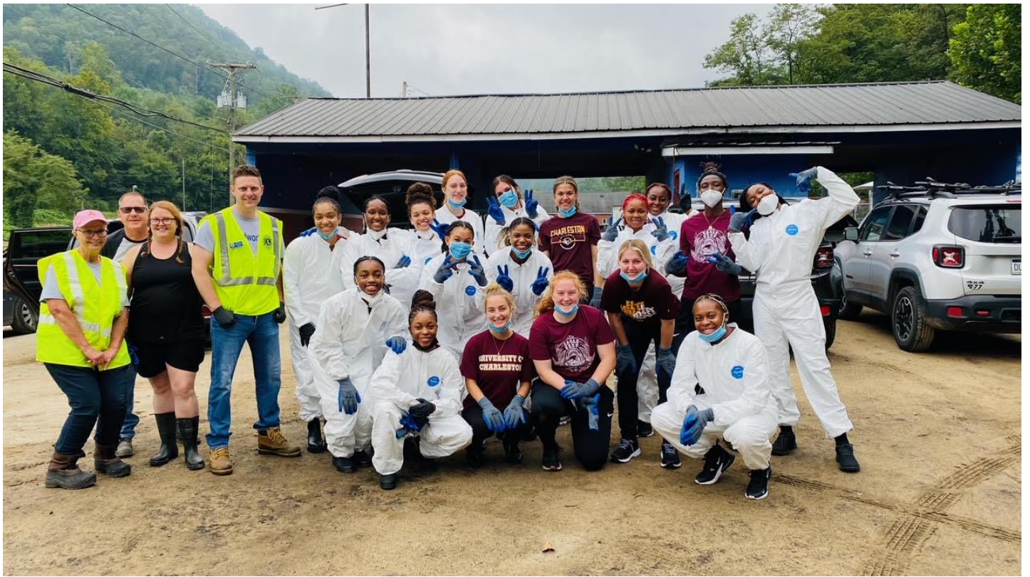
Lions teaming up with the University of Charleston's Women's Basketball team in Smithers, WV