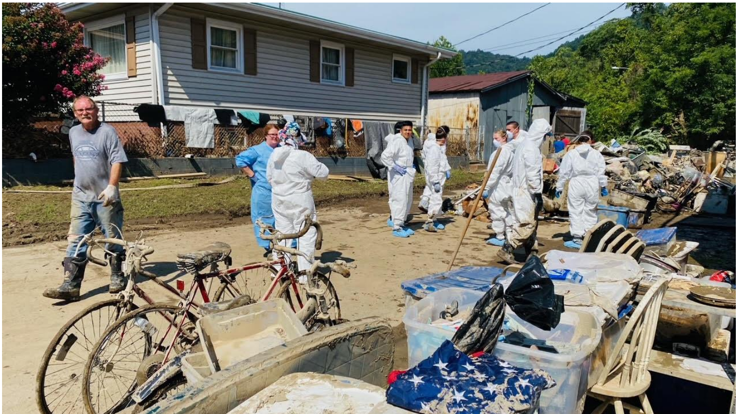
Lions teaming up with medical school students from the West Virginia osteopathic school of medicine to pull flood debris out of homes in Smithers, WV.