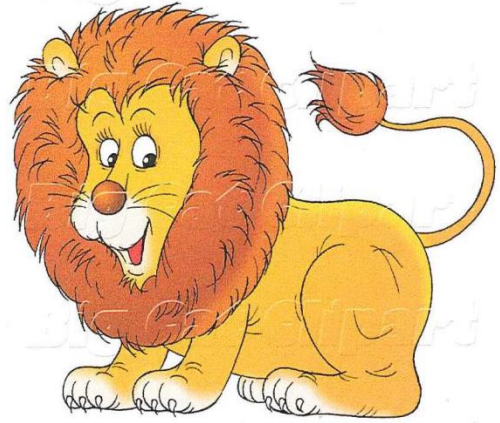
Council Chairman State Convention