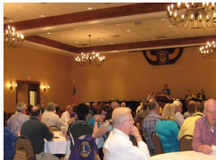
Discussion and Decisions