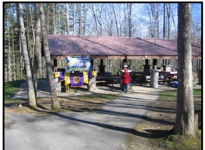
Shelter 3 at Twin Falls State Park used for the Lions 29-C Open House