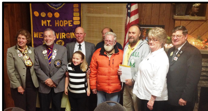
Mt. Hope Lions Nov 20th