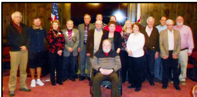
Athens Lions Dec 1st