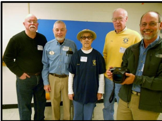
Durbin Lions Vision Screening at the Green Bank School Dec 4. The VS100 is held at right.