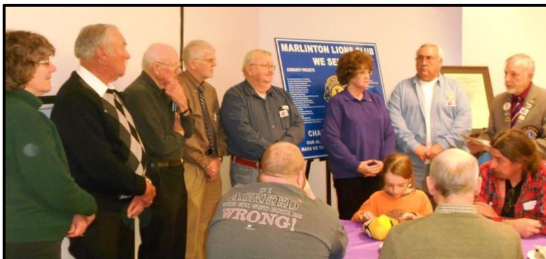
Marlinton Lions receiving service year chevrons at their meeting on January 22.