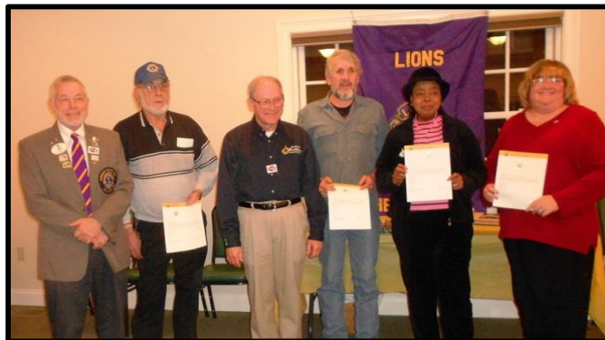
White Sulphur Springs Lions receiving service years chevrons.