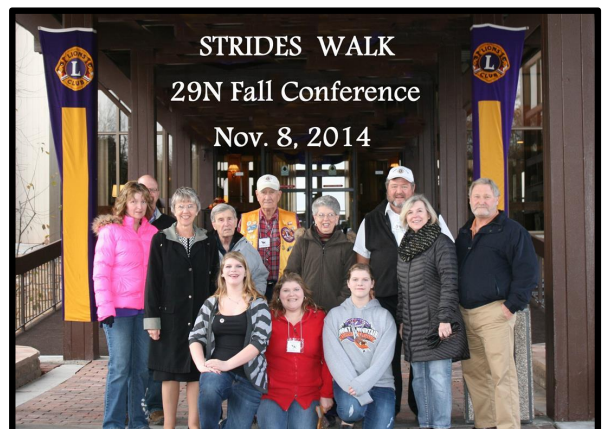
The Strides Walk benefits the Lions Diabetes Awareness Program.