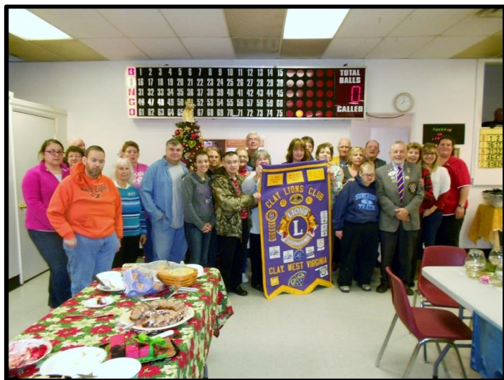
Clay Lions turned out for the Dec 16 th meeting with the DG. The meeting included a covered-dish dinner (with steaks!), and Bingo-for-Toys to benefit local youth.