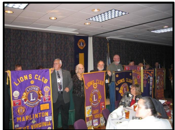
Some of the clubs present in the Banner Parade.