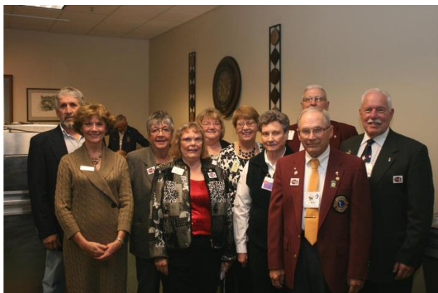
Ten members of the White Sulphur Springs Lions attended the Conference.