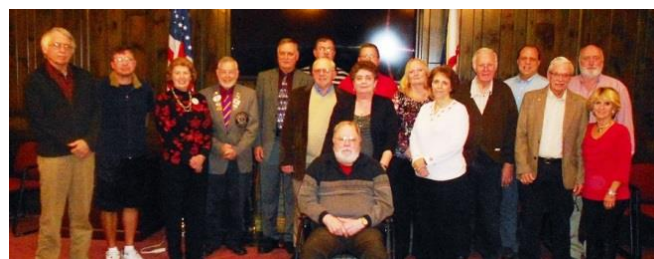
The Athens Lions met with the DG at the Concord University Student Center.