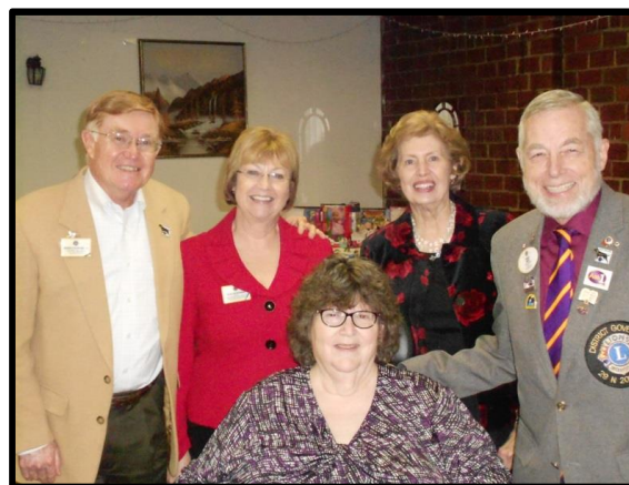
Pineville Lions also met the DG on Dec 6 th at Gary.