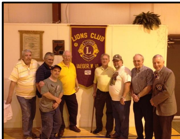
The laeger Lions Club met with the DG May 5 th .