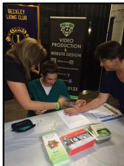
The Beckley Lions booth at the CofC Business Expo.