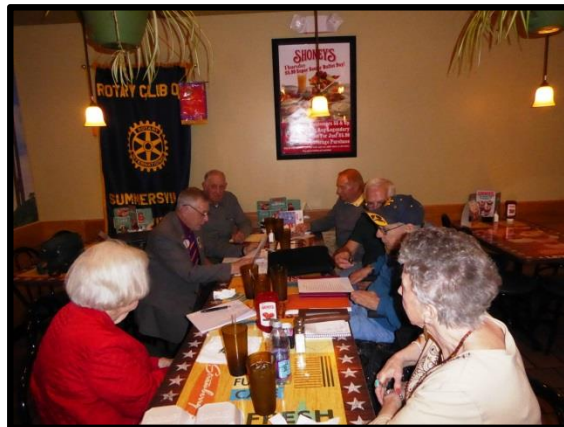
DG & the Summersville Lions met on April 27 th .