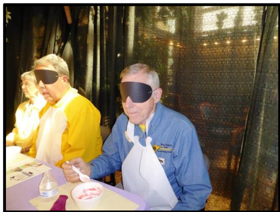
The "Blind Cafe" at the WVU Eye Institute Lions Day.