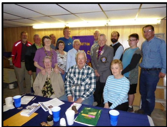
Sutton & Gassaway Lions met with the DG in April.