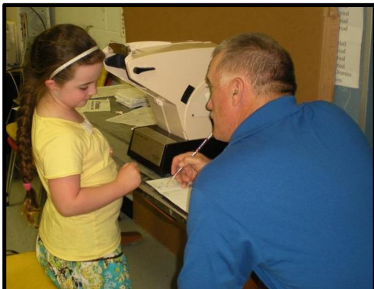
A Durbin Lion screening vision at the Green Bank school.