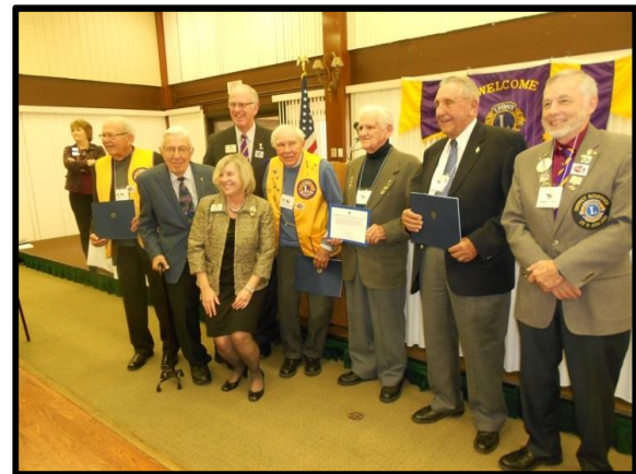
Lions with 50+ years of service were honored at the 29N Conference

Committee recommendation documents were sent to all 29N clubs on November 10th by e-mail. Copies can also be downloaded from the 29N website.