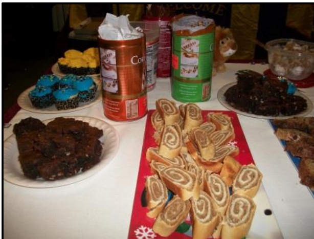
Part of the Hospitality Table at the 29N Convention