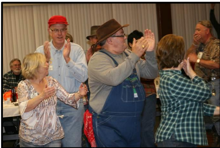
Square dancing at the 29N Conference