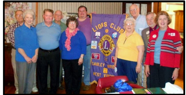
Gauley Bridge Lions