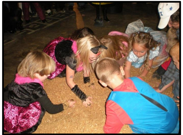
Search is on for treasures buried in sawdust at a Halloween Party co-sponsored by the Durbin Lions.

The Durbin Lions Club, chartered on November 12, 1946, currently has 47 members. Community service events include annual eye screenings at the local school and Senior Center, staffing ticket and concession booths at Pocahontas County school sports, purchasing eyeglasses, sponsoring annual Halloween Parties and Christmas Dinners for the community, and awarding a scholarship for a PCHS senior each year. Fundraising events include selling deep-fried porkskins, holding rifle raffles, and hosting a Pancake Dinner in March. The club meets at the Arbovale Community Center on the 2 nd & 4 th Tuesdays.