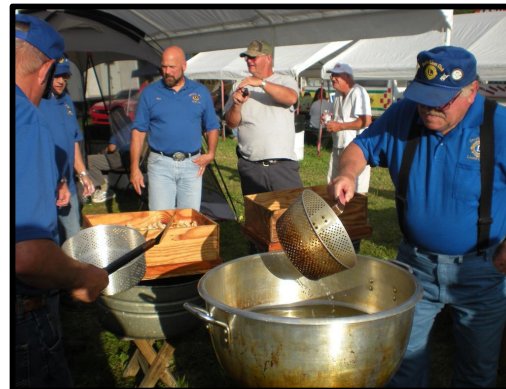
Frying porkskins at Durbin Days.