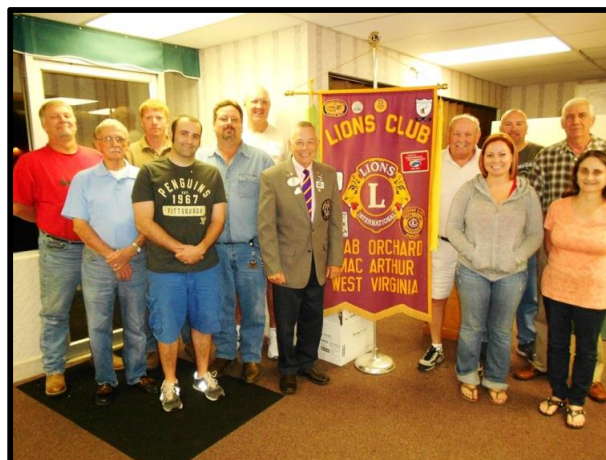
Crab Orchard-MacArthur Lions