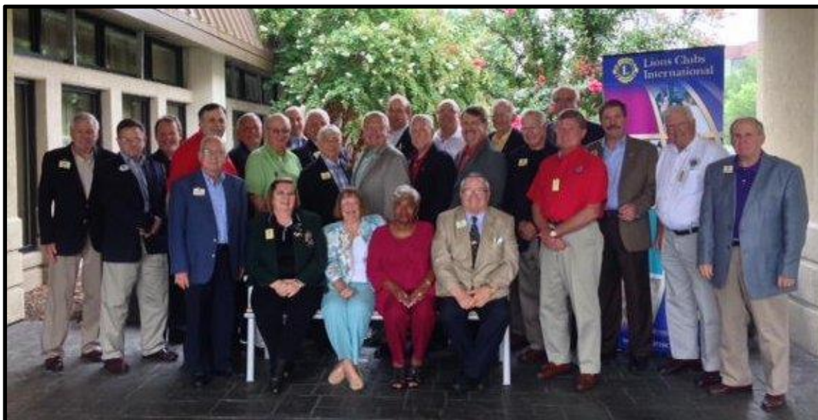
MD LCIF Coordinators from around the nation attended the annual meeting in Baltimore.

Any of the four district LCIF coordinators are available to answer your questions or present a program at your club meetings. They all have $20 donation pins and measles donations pins.