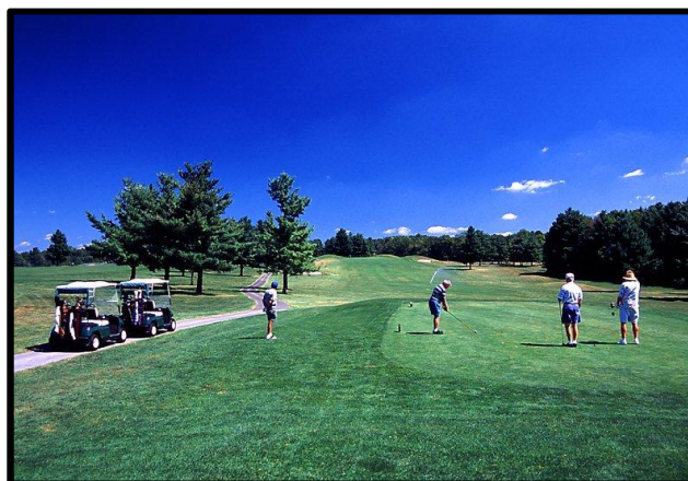
Golfing at Pipestem