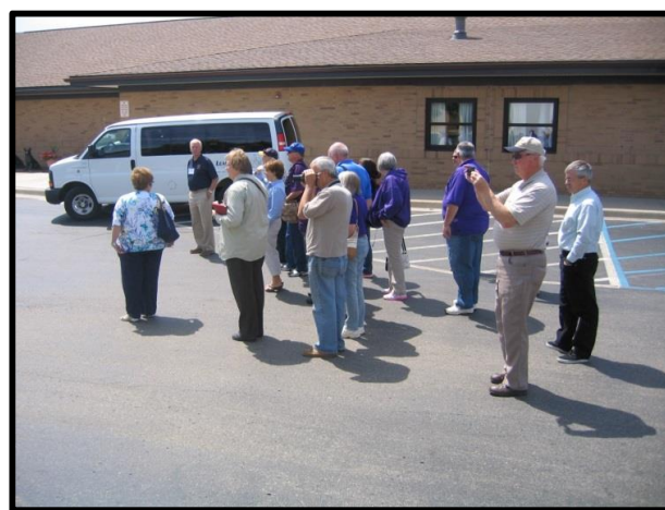
One group of Lions being shown around the complex. It was nice, and informative, to have contact with other Lions from around the world. A few states represented in this group are Montana, West Virginia, Maryland, Michigan, and Florida.

One stop on our points of interest was to talk with some of the Leader Dog trainers. Here I am holding one of the next dogs to be of service to an individual in need. All trainers are super dedicated to their work, and some have almost 30 years of experience.