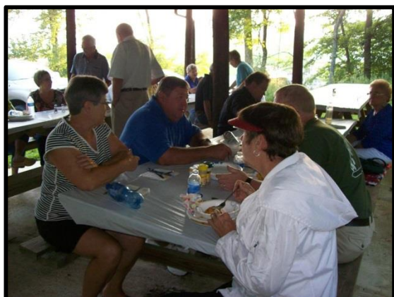
Some of the Rainelle Lions at the Club's summer picnic.