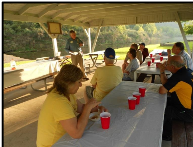
Burnsville Lions meeting on the shores of Burnsville Lake.