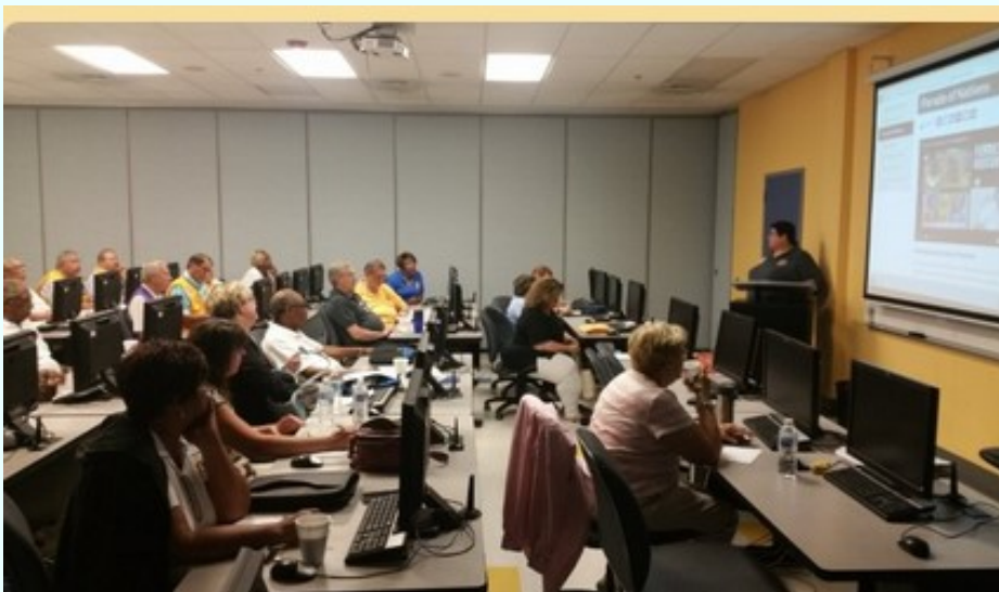
6C Meet, Greet and Eat, Club Officer Training. 41 Lions from 14 clubs & 1 branch!!!! Fantastic!!!!