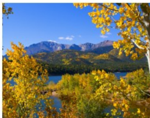
This photo was taken by 2 nd VDG Dianne Christian at Crystal Lake Reservoir, Pikes Peak

The photo contest will run from September 3, 2021 to March 15, 2022. To enter this contest, you will be allowed to send in up to 3 photos showing the Colorado environment. The photos will need to be no larger than 5 x 7 inches on photo stock paper. On the back of the photo put a label with what your photo is, where it was taken and when, and your name and address. Your photos then need to be sent to Lion Barb Guest, 6611 West 5 th Place, Lakewood, CO 80226. The top three winners will be announced at the District Convention in April 2022. The judges will be Lion Barb Guest and 2 nd VDG Dianne Christian.