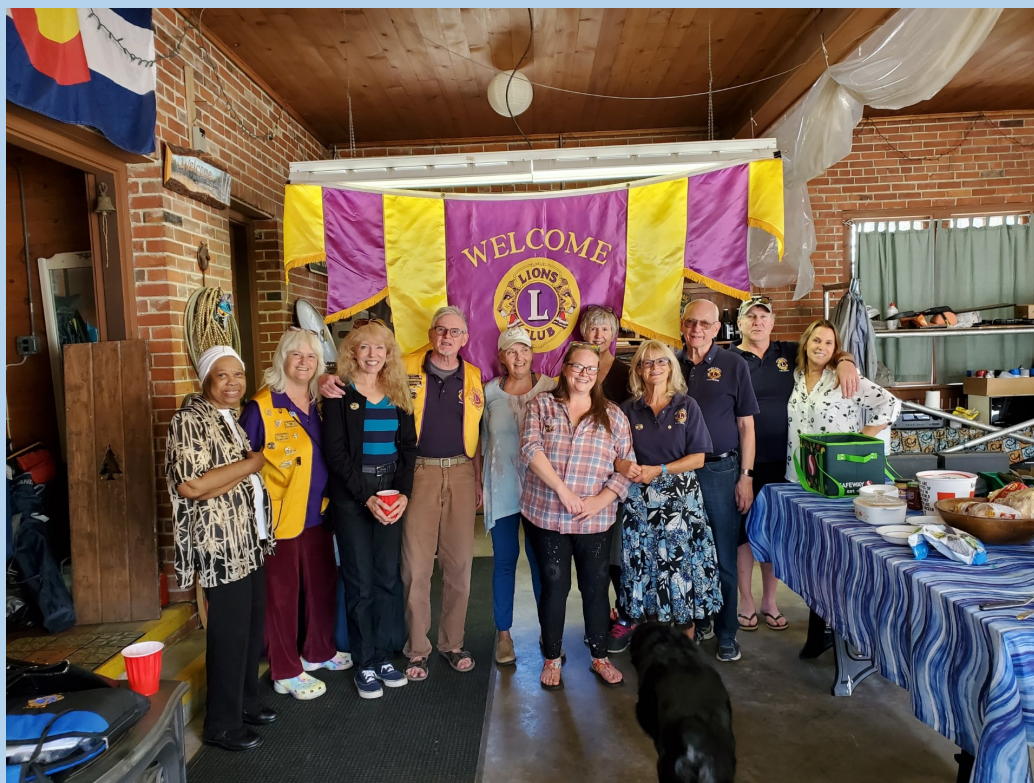
Idaho Springs new member induction