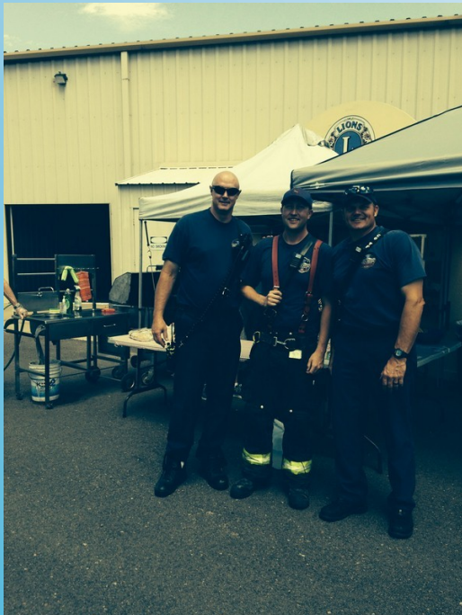
South Metro Firemen that dropped by to eat.

Each Friday we have a different airplane on display for you to see. So far we have had a Stearman, a Citabria and a v-tail Bonanza. We serve beef and turkey burgers and brats. If you upgrade your meal, it includes chips, cookies, soda or water, and fruit. Prices range from $4.50 to $5.00 if you add cheese plus $2.00 to upgrade to a meal deal. Double Cheeseburgers are $6.00. There are picnic tables in the shade so you