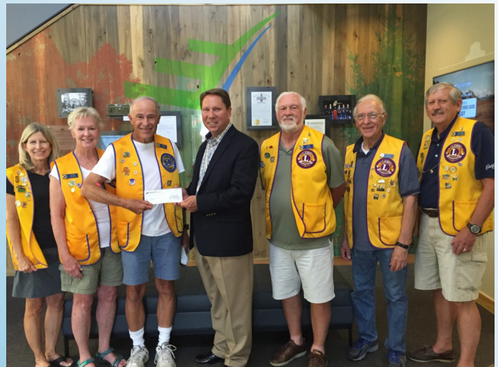
Louisville Lions Club worked with Elevations Credit Union to collect eyeglasses for recycling. Elevations collected over 900 pairs of glasses at their branch offices, and gave the Louisville Lion's Club a check for $1,000.