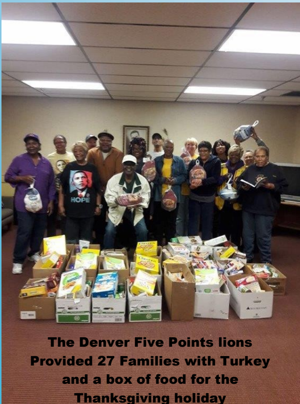
The Denver Five Points lions Provided 27 Families with Turkey and a box of food for the Thanksgiving holiday