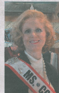
Ms. Colorado Senior America in interview at left.

of her reign. She has already thrown about the Prayer One helicopter, been showcased on Channel 9, had numerous articles written about her, ridden in parades, sang for various senior centers, spoken for numerous organizations and inspired countless individuals. One of her wishes is to sing The Star Spangled Banner at a Broncos or Rockies game.