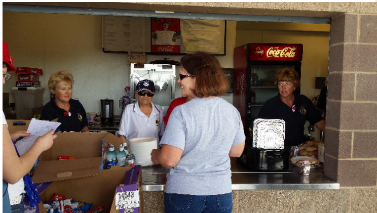
Broomfield Lions serve Veterans on Memorial Day