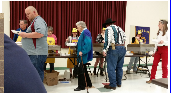
Pleasant View Lions Easter Pancake Break-