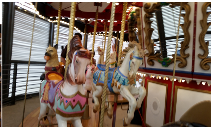
6C Lions running the Thornton Carousel