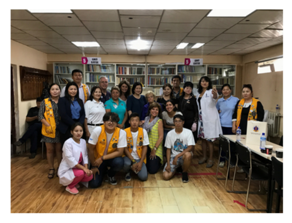
Ulaanbaatar volunteers. Most of the interpreters were kids and college students, who were more likely to be bilingual than the adults.