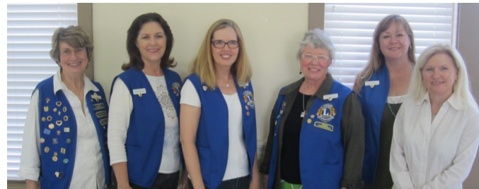
Above: Greenbelt Alliance project