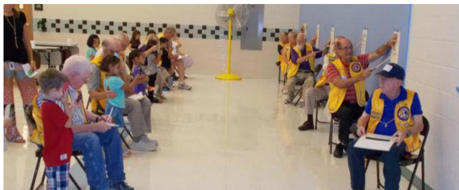
Eye testing the old fashioned way

The operation at SPP went off unreasonably smoothly given the long hiatus since January, but only because the veterans of a lot of campaigns were on hand to set it up, tear it down and help the new folks find their way. It all gets easier with repetition. Thanks to all who gave of their time, and to Skip for stepping up to take on this load, our signature service to the community.