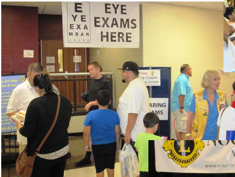
Pictured Left: Parents lined up to register for their child's KidSight vision screening (KSVS).

Pictured Right: A small part masses at the Round Rock ISD festival to welcome students back to school.