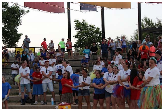
The Awards Night concludes the evening with Green Trees & Taps.