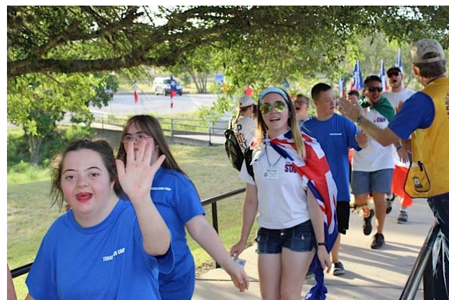
Greeting the Campers as they enter.