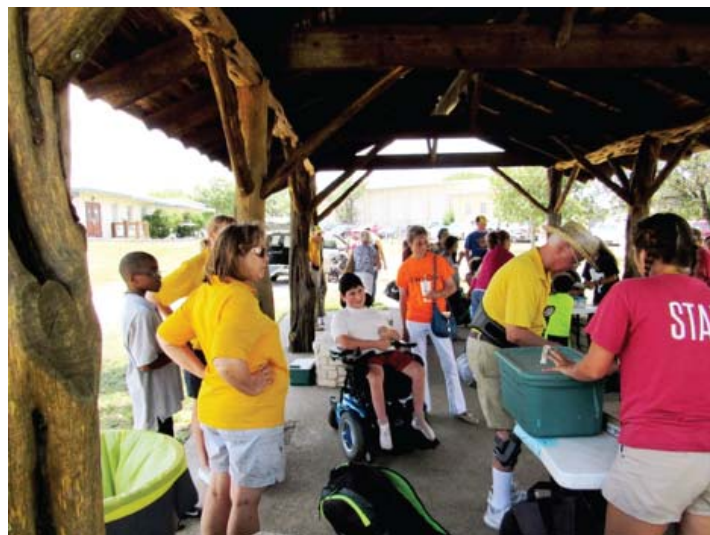
On 07/03/2016: Lions assisted campers with luggage check-in process.