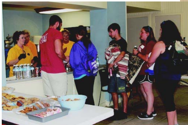
On 07/03/2016: Lions assisted campers with the concession stand during the check-in process.