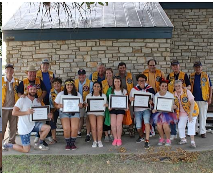
Garden Ridge Lions and six happy Camp Counselors. Each Counselor received a $750.00 scholarship from the Garden Ridge Lions Club.