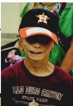
Other campers who arrived and were very excited about their upcoming week.