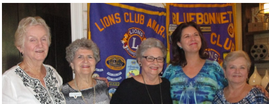
Below: Charter members of Bluebonnet Lioness Club