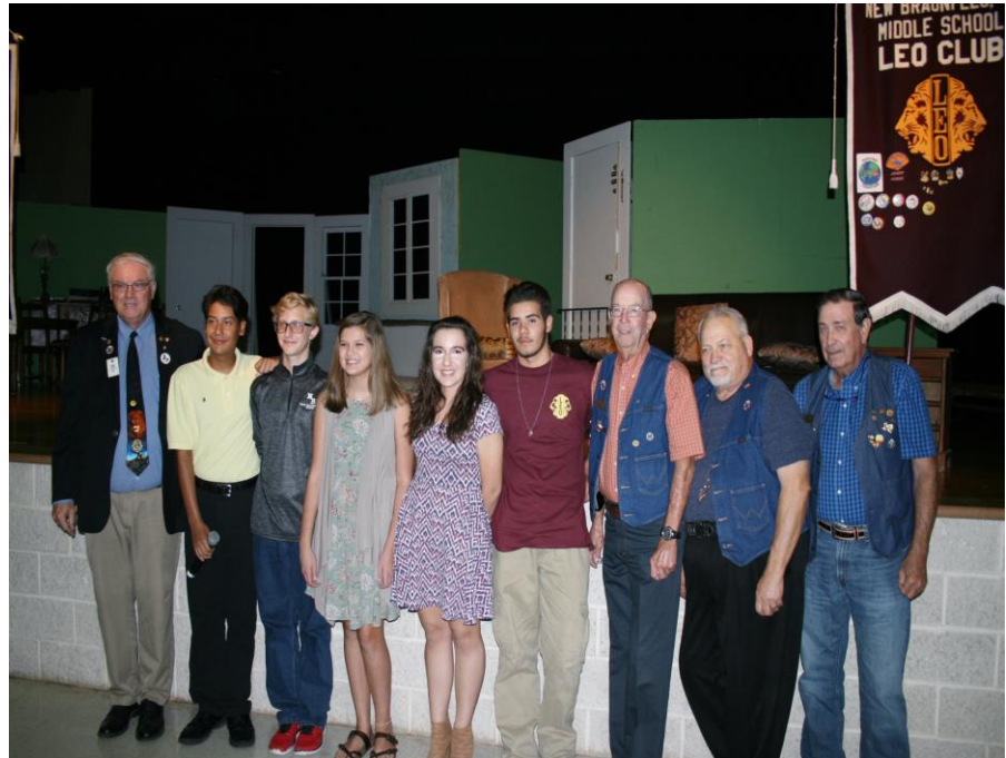
Ninth Grade Center LEOS 2017-2018

LEO Induction Ceremony October 4, 2017- See Pics Below