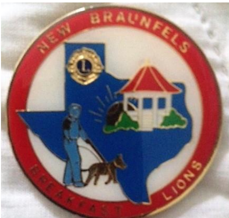
NB Breakfast Lions Club Pin