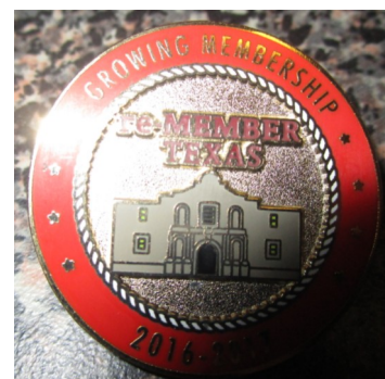
Above right: LCI 2016 Growing Membership award pin