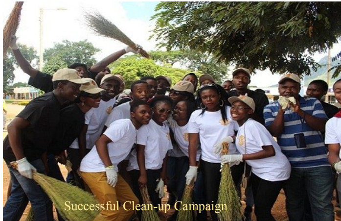
Successful Clean-up Campaign