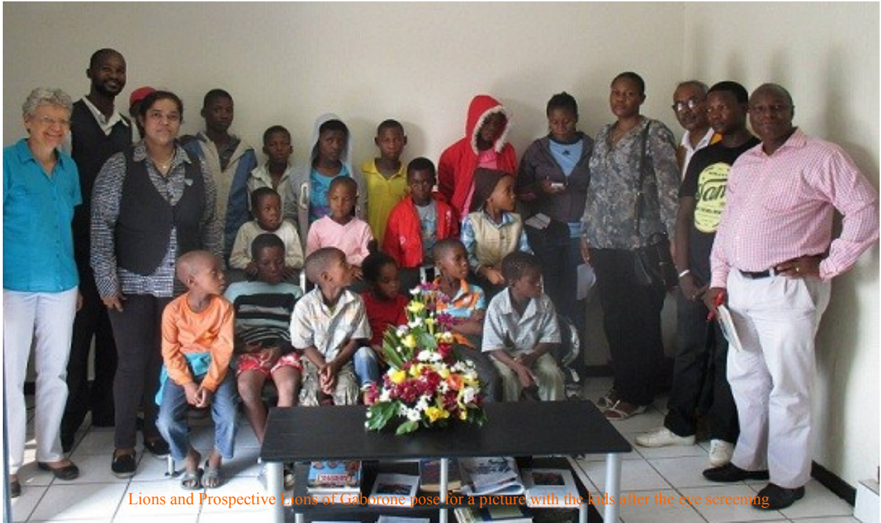
Lions and Prospective Lions of Gaborone pose for a picture with the kids after the eye screening