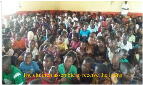
The children assemble to receive the Lions

Receiving the items both the Manager for Adziwa Orphanage and Village of Hope Orphanage expressed gratitude at the donation made by the State Vice President through the Lions Club of Capital City.