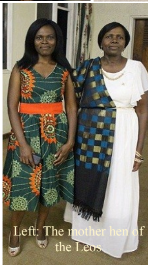
Left: The mother hen of the Leos