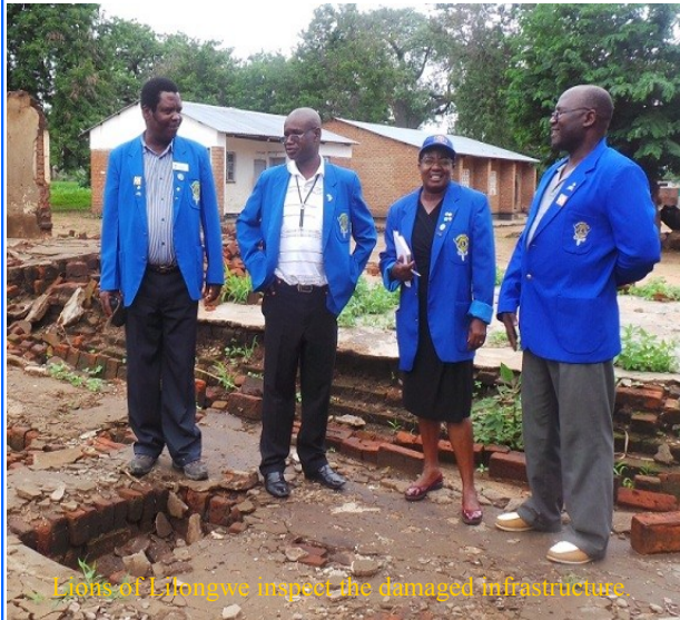
Lions of Lilongwe inspect the damaged infrastructure

The lakeshore district of Mangochi is one of the 15 districts of Malawi that were hit hard by flooding waters at the turn of the year. People in the area like many other affected areas lost their crops, household items and food that included the staple food maize and livestock. There were also reports of people losing loved ones who were swept away by the onrushing water coming from the mountains heading to the lake.