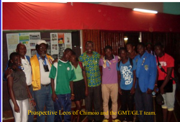
Prospective Leos of Chimoio and the GMT/GLT team.

“...To encourage service minded people to serve their community without financial reward, and to encourage efficiency and promote high ethical standards in commerce, industry, professions, public works and private endeavors...”