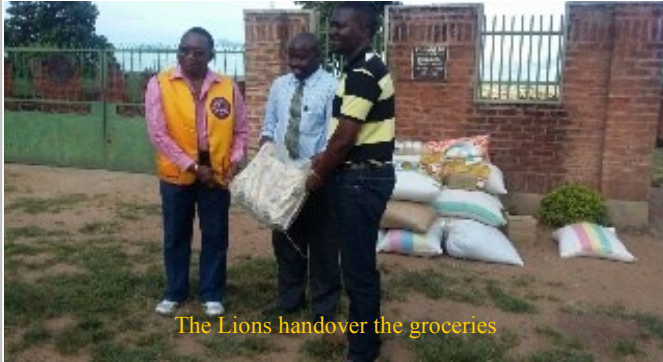
The Lions handover the groceries

The State Vice President of the Republic of Malawi Right Honorable Saulosi Klaus Chilima, on 1st April 2015 made a donation of K1,000,000-00 (US$ 2,000) to Lions Club of Capital City. The State Vice President made the donation to Lions Club of Capital City for the club to identify two orphanages on Lilongwe where the club would purchase items that the orphanages would be in dire need for at the celebration of the 2015 Easter Holidays.