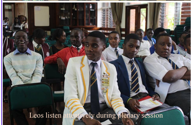
Leos listen attentively during plenary session