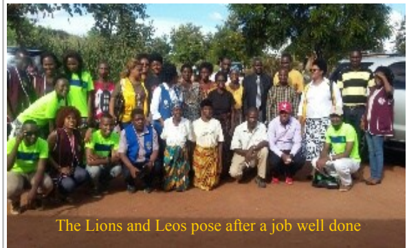
The Lions and Leos pose after a job well done