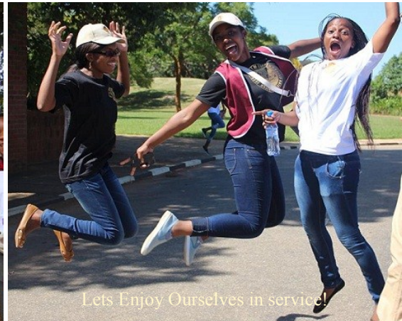
Lets Enjoy Ourselves in service!