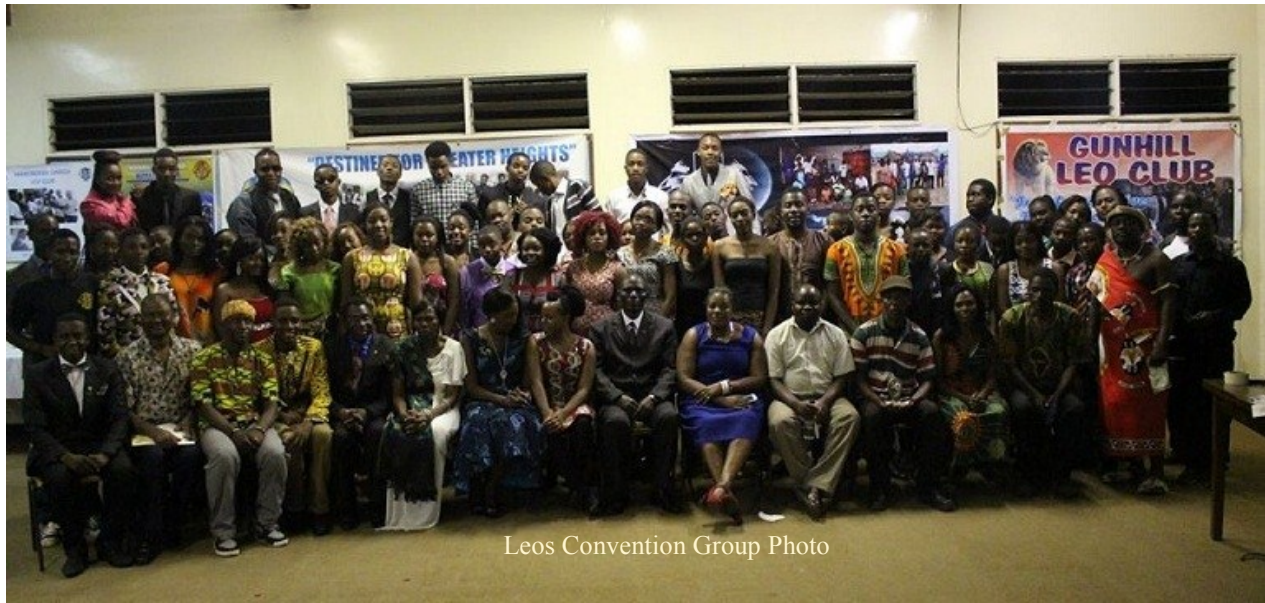
Leos Convention Group Photo