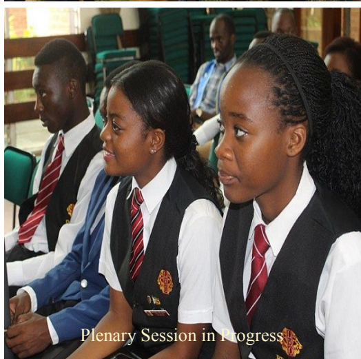
Plenary Session in Progress