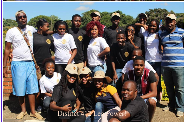
District 412 Leo Power!