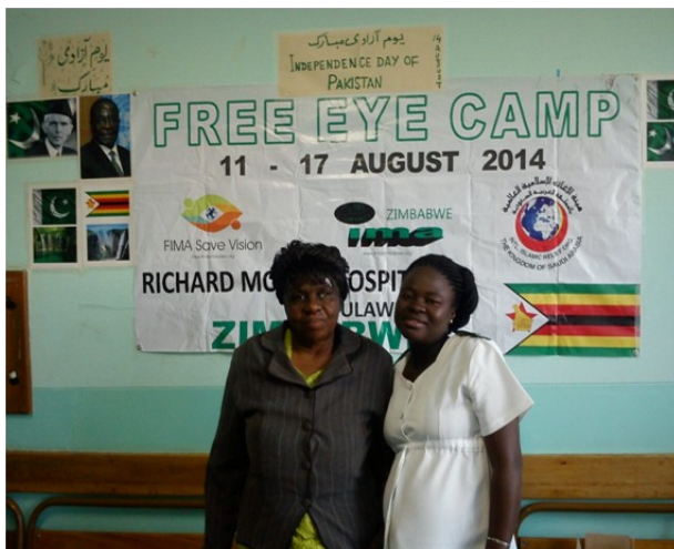
This lady was with her granddaughter who was expecting her first child. They were so glad that she was getting the operation and would be able to see her great grandchild!

The Eye camp ran from the 11– 17 August 2014. About 93 cataract operations were done on the first day. But many more were screened downstairs!