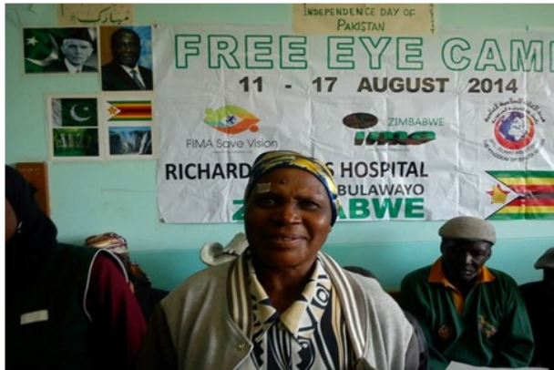
The lady who turned 72 years old, on the 14 th August, the 4 th day of the Eye Camp, before the operation. She was so happy, as her daughter had brought her to have a Happy Birthday, by getting the sight back in her right eye!