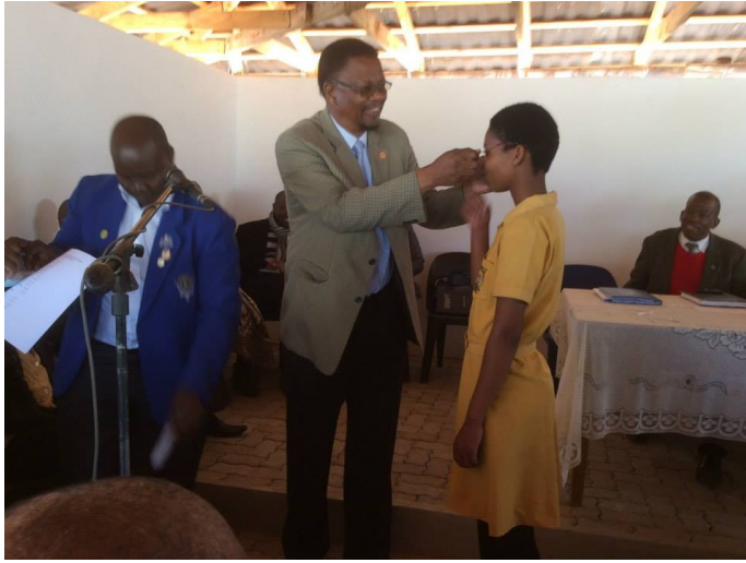
Distribution of Eyeglasses for students of CHICHI CJSS

Screening of 380 students of Chichi Community Secondary Junior School was done in November 2013. The Lions Club of Lobatse regularly sends scripts to Operation Brightsight where recycled glasses are obtained at a lower cost. Operation Brightsight collects glasses from several countries around the world, removes the lenses sorts, cleans and uses the good frames to prepare new eyeglasses. We are very grateful to Operation Brightsight ( a project of the Lions Clubs in South Africa) who helps us out from time to time. The spectacles were distributed by the Minister for Lands and Housing to 34 students who had refractive errors. Hopefully these students will be able to perform better and obtain better grades having improved their vision. We the Lions of Lobatse are always happy to serve the community we live in. — at Molapowabojang Village.