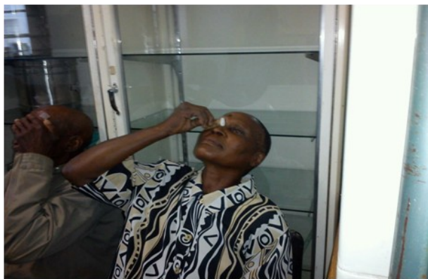
The man who had not ever seen his 14 year old grandchild was very excited as he would be able to see her for the first time!