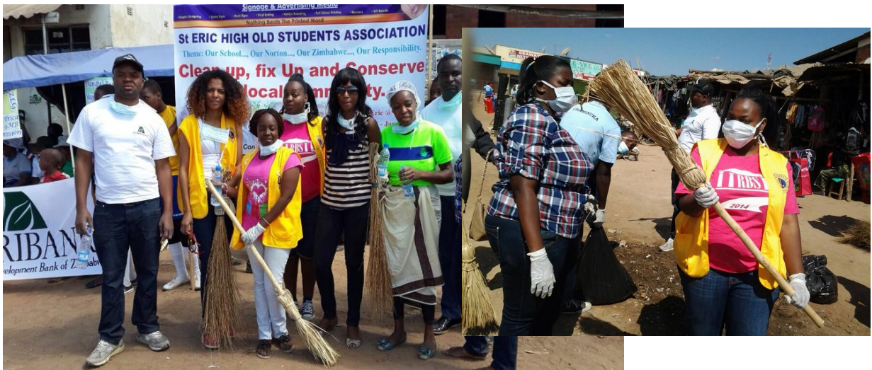
On Saturday 2 August 2014 Lions Club of Harare took part in the Norton Clean Up campaign.