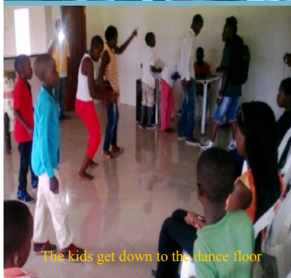
The kids get down to the dance floor