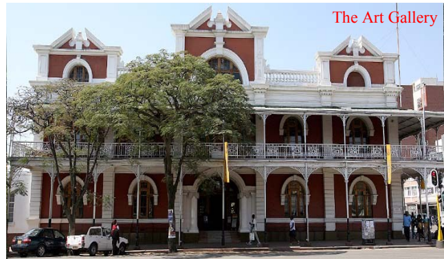
The Art Gallery

We look forward to hosting you in the City of Kings! Look out for the National Art Gallery, the National Museum, Fine works of Art in our Curio Shops and much more! The Matopos Hills and Chipangali Wildlife Conservancy are just a 20 minutes drive from the City!