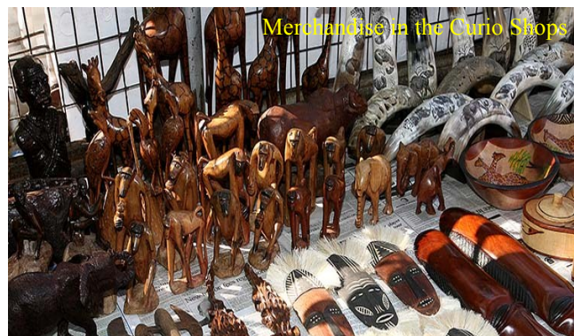
Merchandise in the Curio Shops