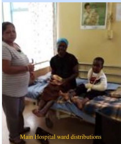
Main Hospital ward distributions