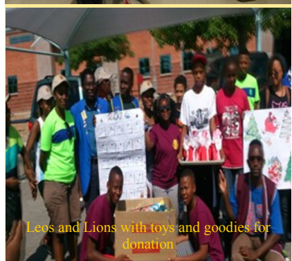
Leos and Lions with toys and goodies for donation