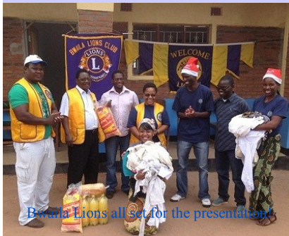
Bwaila Lions all set for the presentation