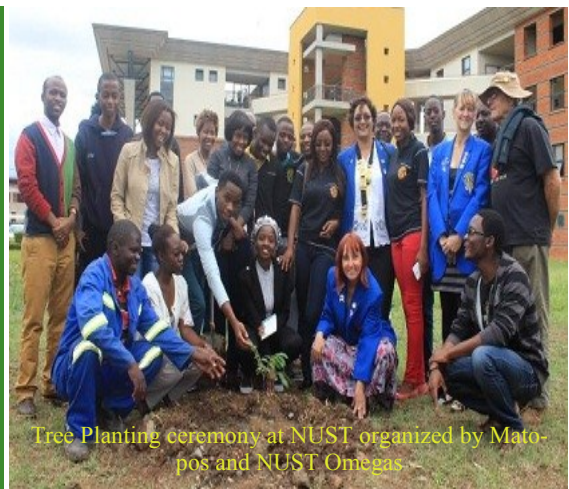
Tree Planting ceremony at NUST organized by Matopos and NUST Omegas

On the 3rd of December Lions Club of Harare the Phoenix together with prospective Lions of Norton planted 125 trees at St Eric High School in Norton.