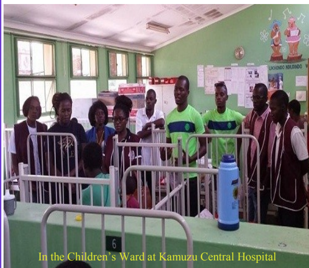
In the Children's Ward at Kamuzu Central Hospital