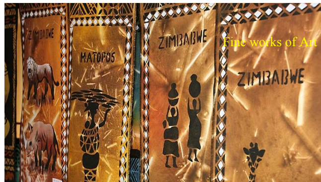
Fine works of Art