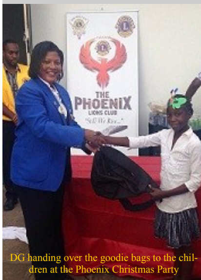
DG handing over the goodie bags to the children at the Phoenix Christmas Party