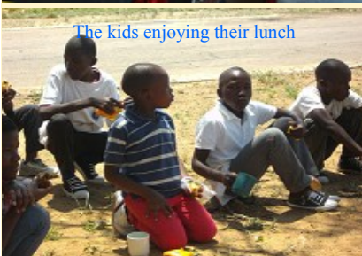
The kids enjoying their lunch