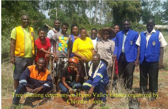
Tree planting ceremony in Hippo Valley Estates organized by Chiredzi Lions