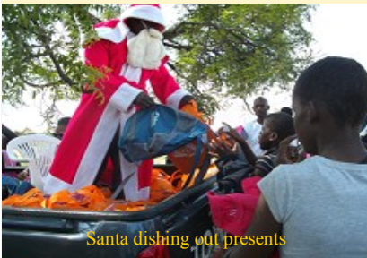
Santa dishing out presents