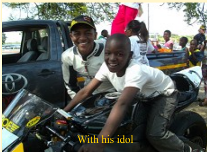
With his idol

On 6th December ,twenty children from John Smale Home , were collected by Toyota Zimbabwe to attend the races at Breedon Everard Raceway. These children were treated to a day of racing, a visit by Santa and some of the racing drivers on their motorbikes! Santa gave the children satchel filled with stationery, exercise books and other school equipment. They also got parcels containing basic commodities e.g. candles, face soap, biscuits and sweets. Ten other children, from Queen Elizabeth Home, were unable to attend as permission had not been obtained by the home, in time from Social Services. A great day was had by all! The two homes also received 9 two litre bottles of juice and 10kgs of sugar. The Lions Club of Matopos would like to extend their sincere thanks to Toyota Zimbabwe and Castrol for their continued support of this project. The children are made to feel like "Kings and Queens" for the day!