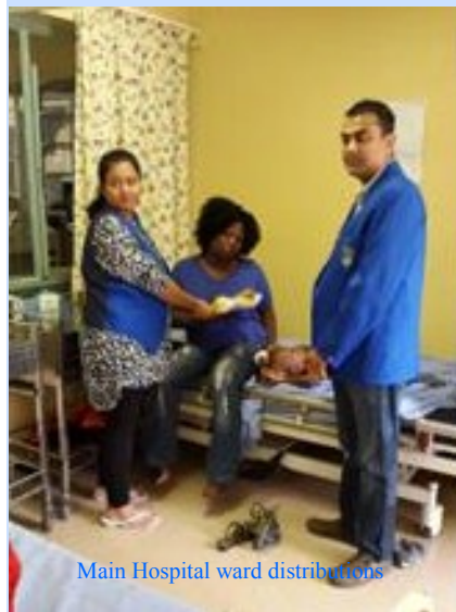
Main Hospital ward distributions