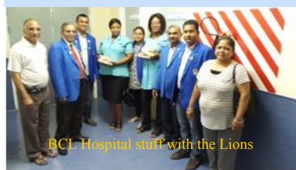
BCL Hospital staff with the Lions