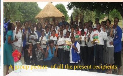
A group picture of all the present recipients

On the 27th of November 2014, Maun -Greater Lions went to Boyei school to show love and fellowship in line with the spirit of Christmas. Boyei School has 31 hearing impaired students . All Lion members in partnership with staff members at FNB donated a pair of shoes each to each of the children. The kids were also each given a Samaritan box which comprised of stationery, towels, toiletries, a bible, etc. The afternoon was filled with fun through dances from the School and teachers, which the children were able to present a traditional dance piece for us.