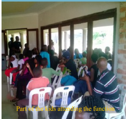
Part of the kids attending the function