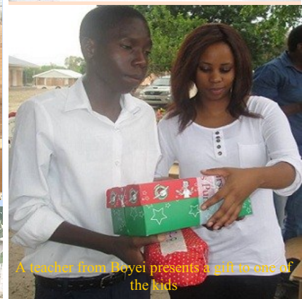
A teacher from Boyei presents a gift to one of the kids