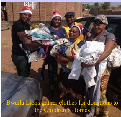
Bwaila Lions gather clothes for donations to the Children's Homes