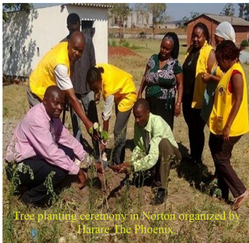
Tree planting ceremony in Norton organized by Harare The Phoenix