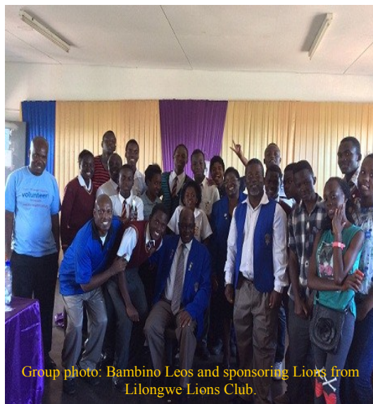
Group photo: Bambino Leos and sponsoring Lions from Lilongwe Lions Club.

On 5 th December which happens to be the international day of volunteerism, the Bambino LEO Club was invited to an activity commemorating the day. Volunteers drawn from several organizations that included the American Peace Corps, Volunteer Services Overseas, Australian Volunteer Organization and the United Nations Volunteer office and the Bambino Leo Club took part in a major cleaning exercise of the Kamuzu Central Hospital, the biggest referral hospital in the capital, Lilongwe. The Leos subdivided into several groups cleaned various sections of the hospital. They scrubbed walls, mopped floors and swept the grounds and corridors of the hospital and handed out water and fruits to other volunteers. It was an action and fun filled fun day.