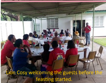
Lion Cosy welcoming the guests before the feasting started.