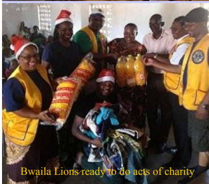
Bwaila Lions ready to do acts of charity