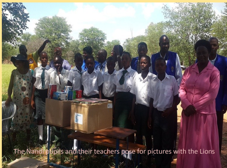
The Nandi pupils and their teachers pose for pictures with the Lions