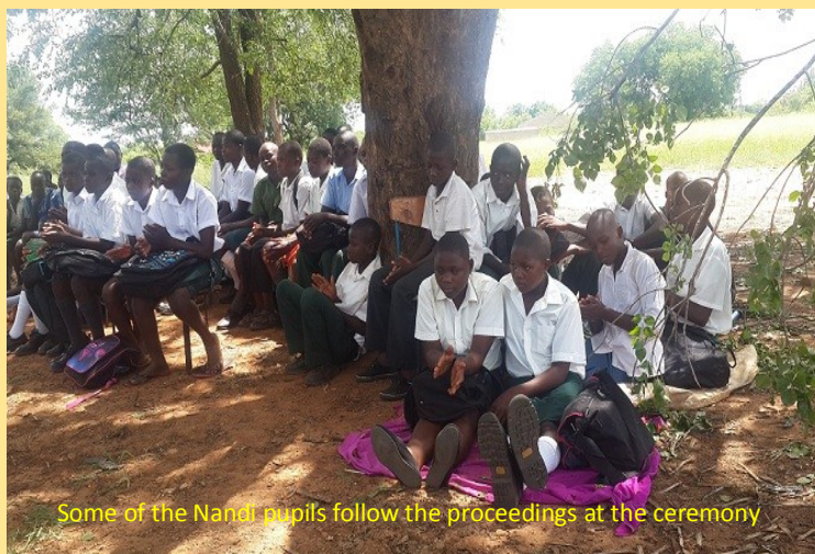
Some of the Nandi pupils follow the proceedings at the ceremony