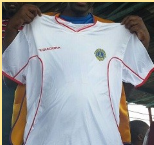
Above: A sample of the kit presented to the winners of the tournament - Hippo Select FC