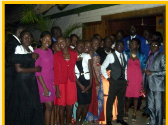
Group photo after the Induction function