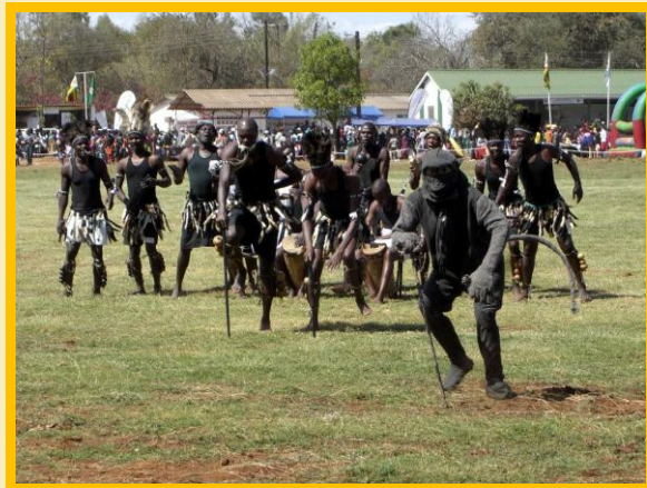
Above: Traditional Dance performance