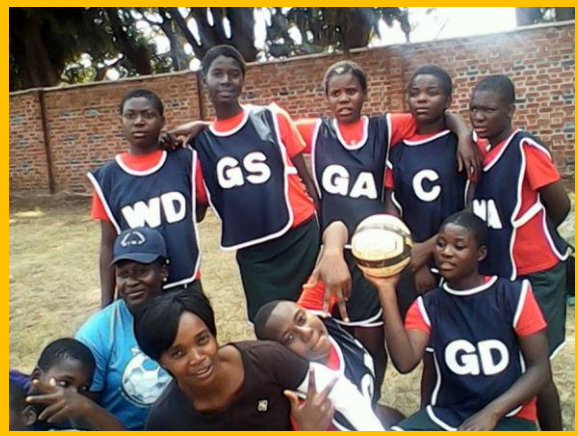
Netball Kit donated by Chiredzi Lions Club