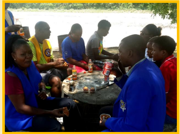
Refreshments after a hard day's work