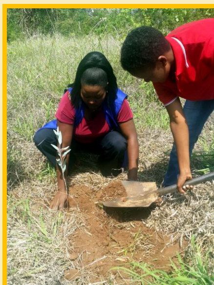
Lion Jessie and Leo Memory