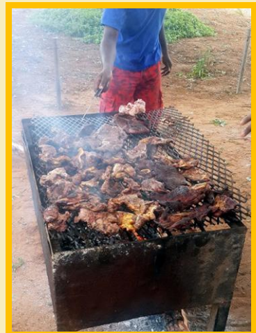
Right: Delicious Braai