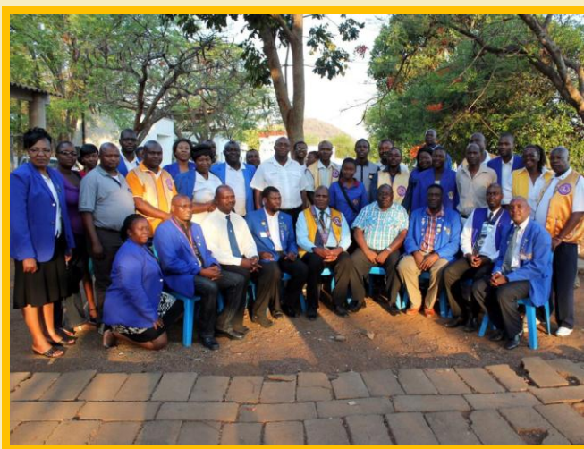
Zone 3A Lions