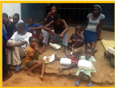
Left: Feeding families of the blind community