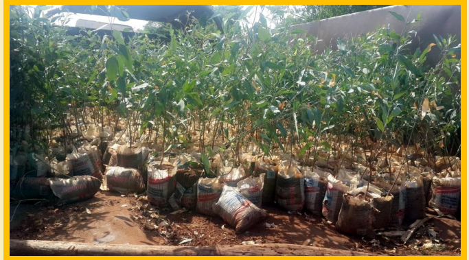
500 Eucalyptus/Gum trees to plant