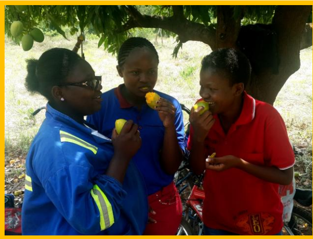
Hard earned break