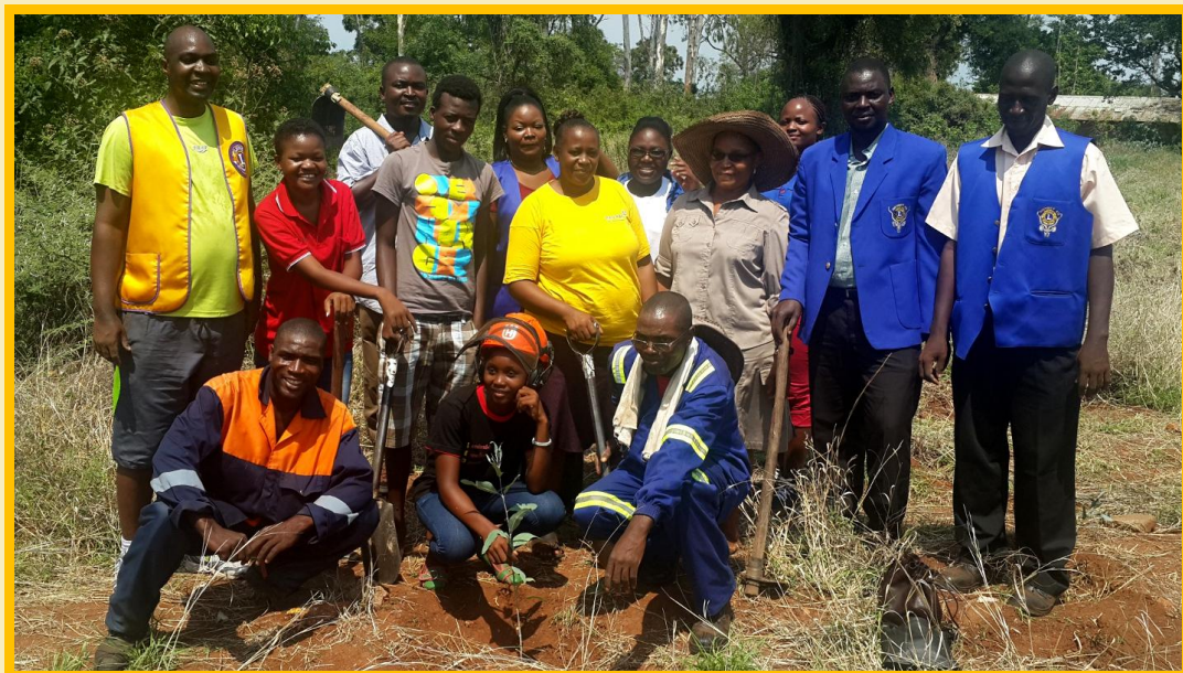
Tree planting Lions and Leos