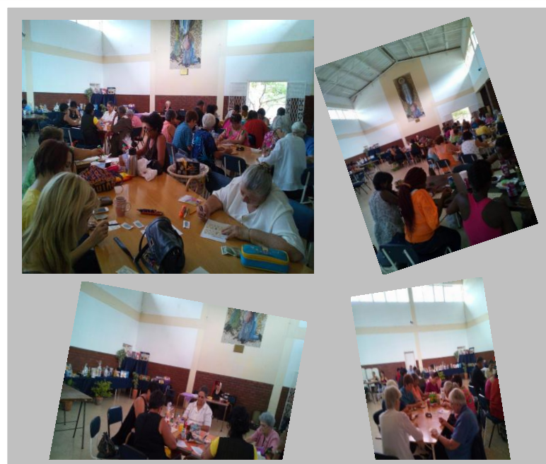
NOVEMBER FUN BINGO AT OUR LADY OF LOURDES "MATOPUS ROCKS"..... RJ